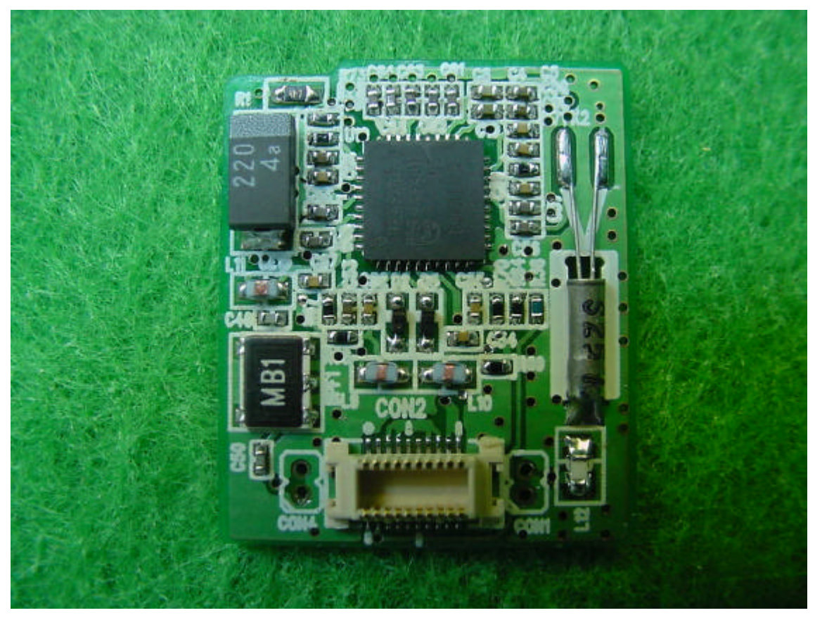
<FRONT SIDE OF TURNER BOARD>