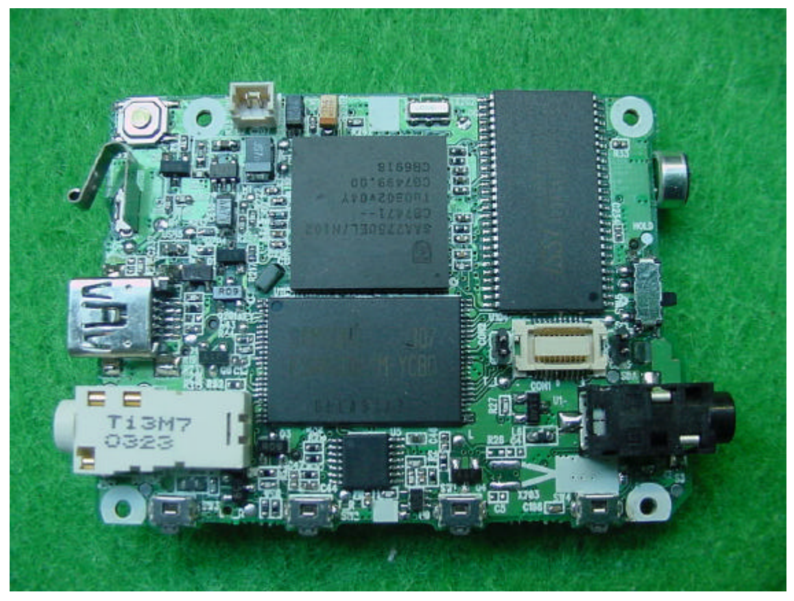
<REAR SIDE OF MAIN BOARD>