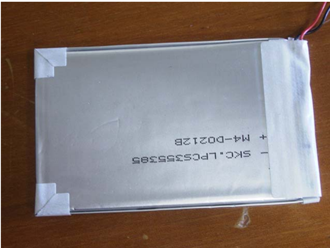
< FRONT SIDE OF BATTERY>