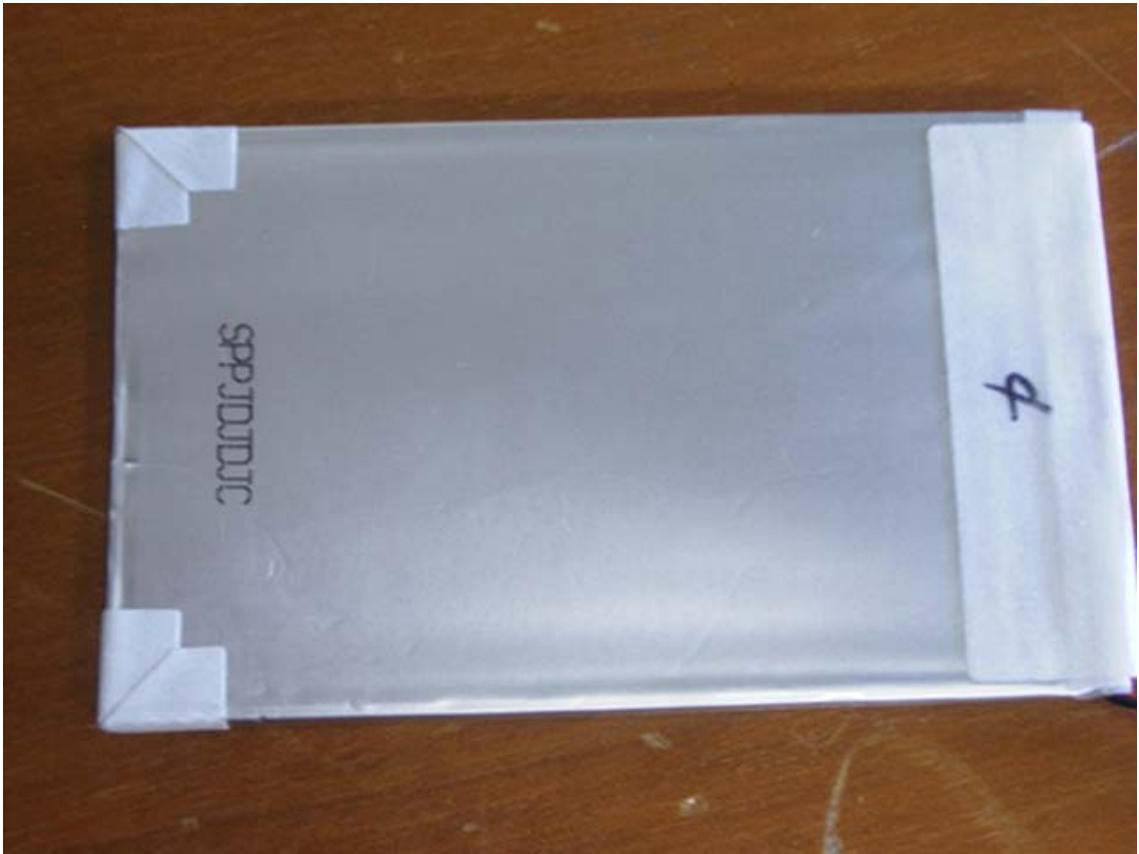
< REAR SIDE OF BATTERY >