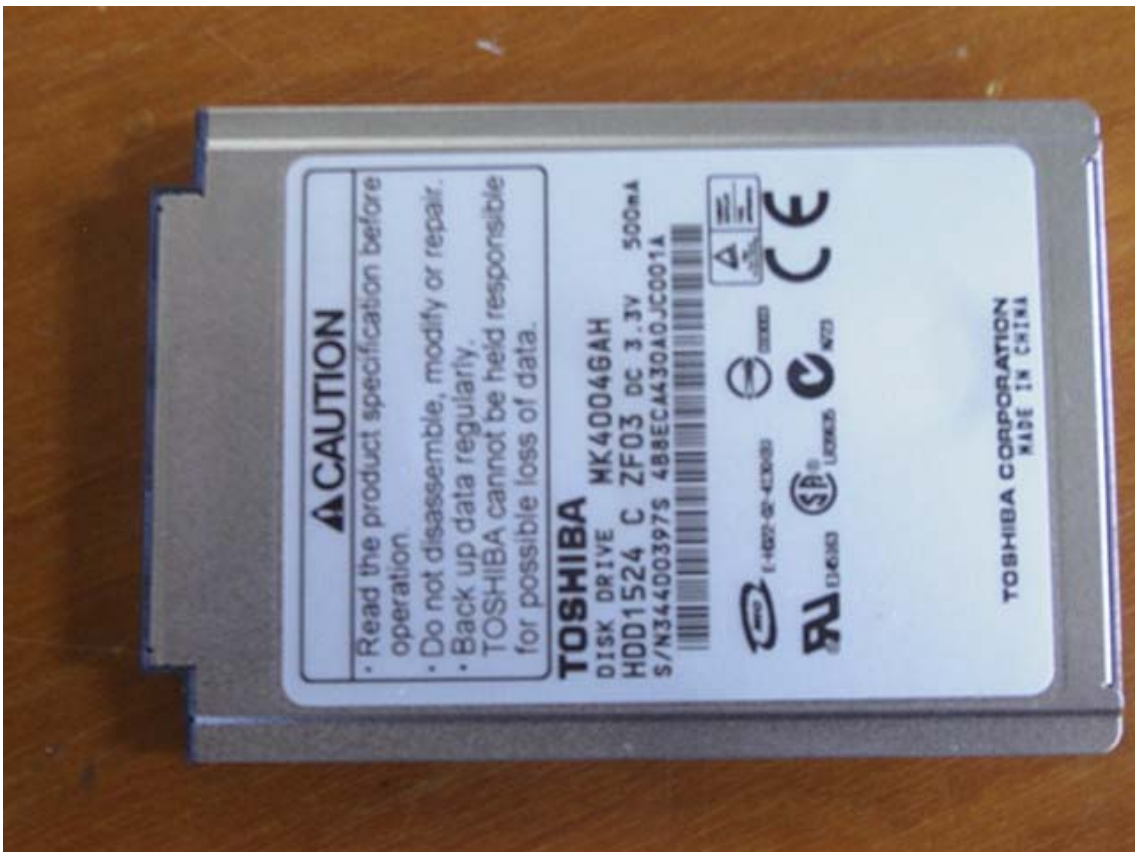
<FRONT SIDE OF HDD>