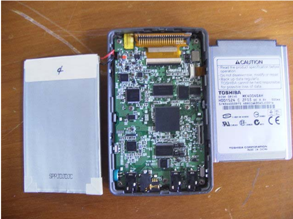
<INNER SIDE OF EUT>