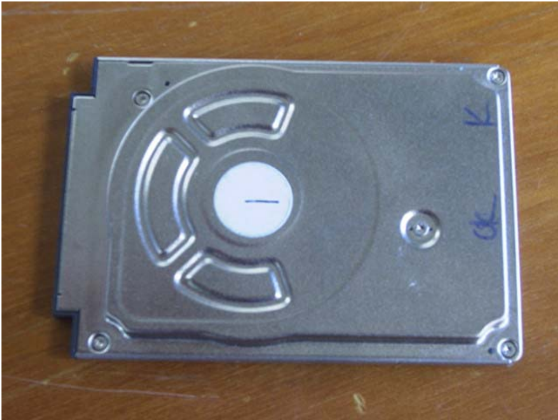
<REAR SIDE OF HDD>