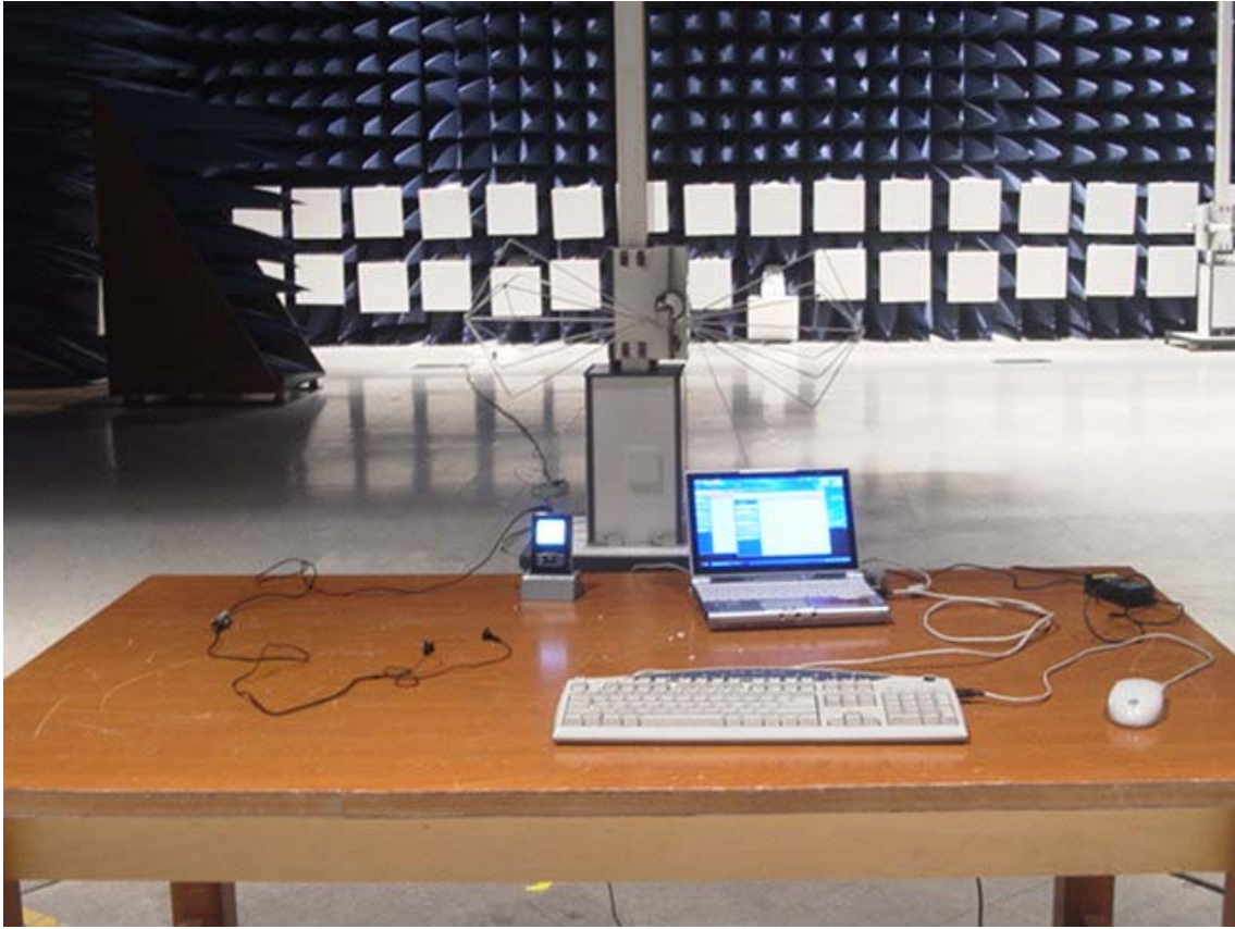
<FRONT PHOTO OF RADIATED DISTURBANCE >