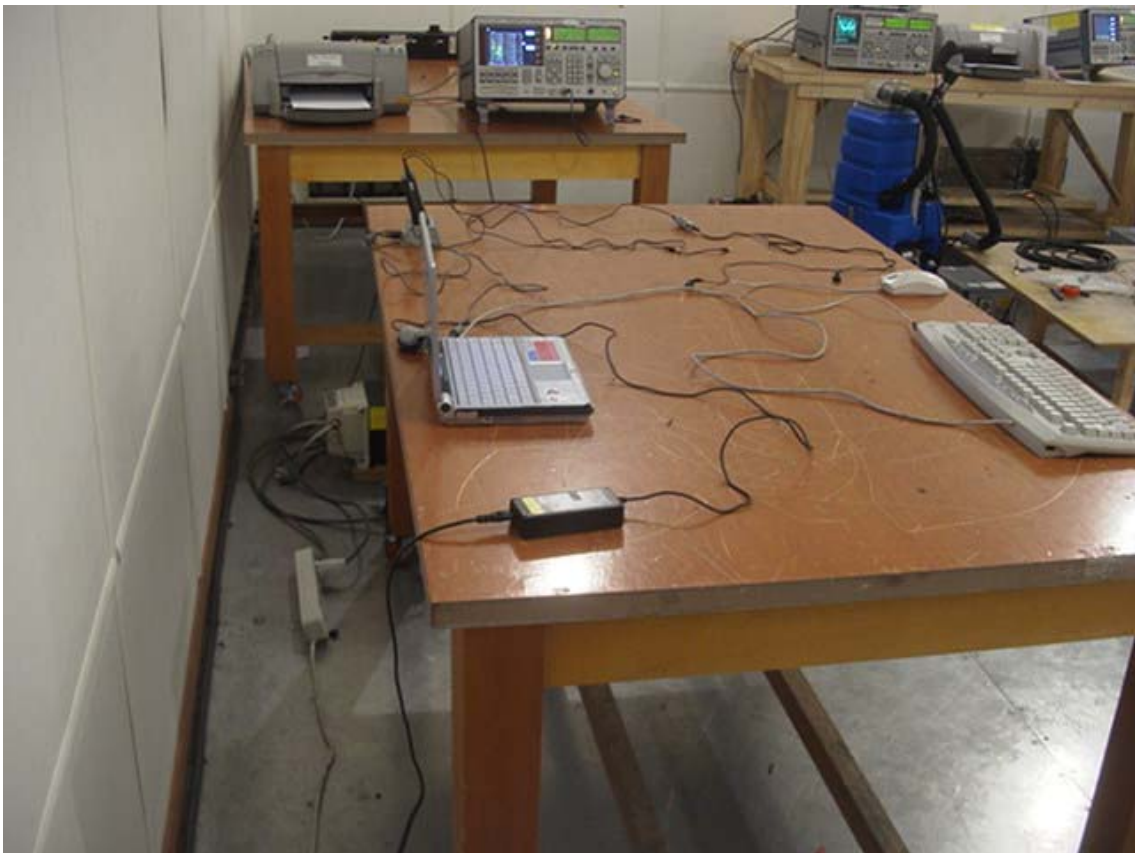
<SIDE PHOTO OF CONTINUOUS DISTURBANCE VOLTAGE >