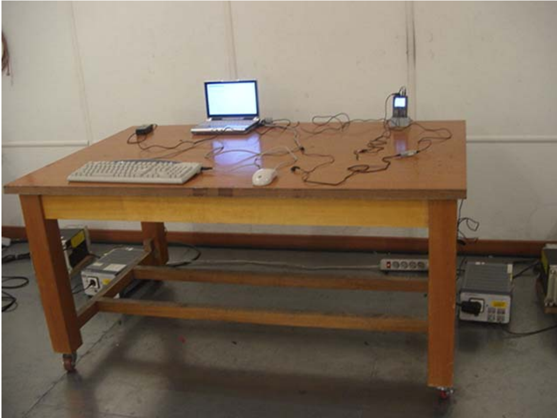
<FRONT PHOTO OF CONTINUOUS DISTURBANCE VOLTAGE >