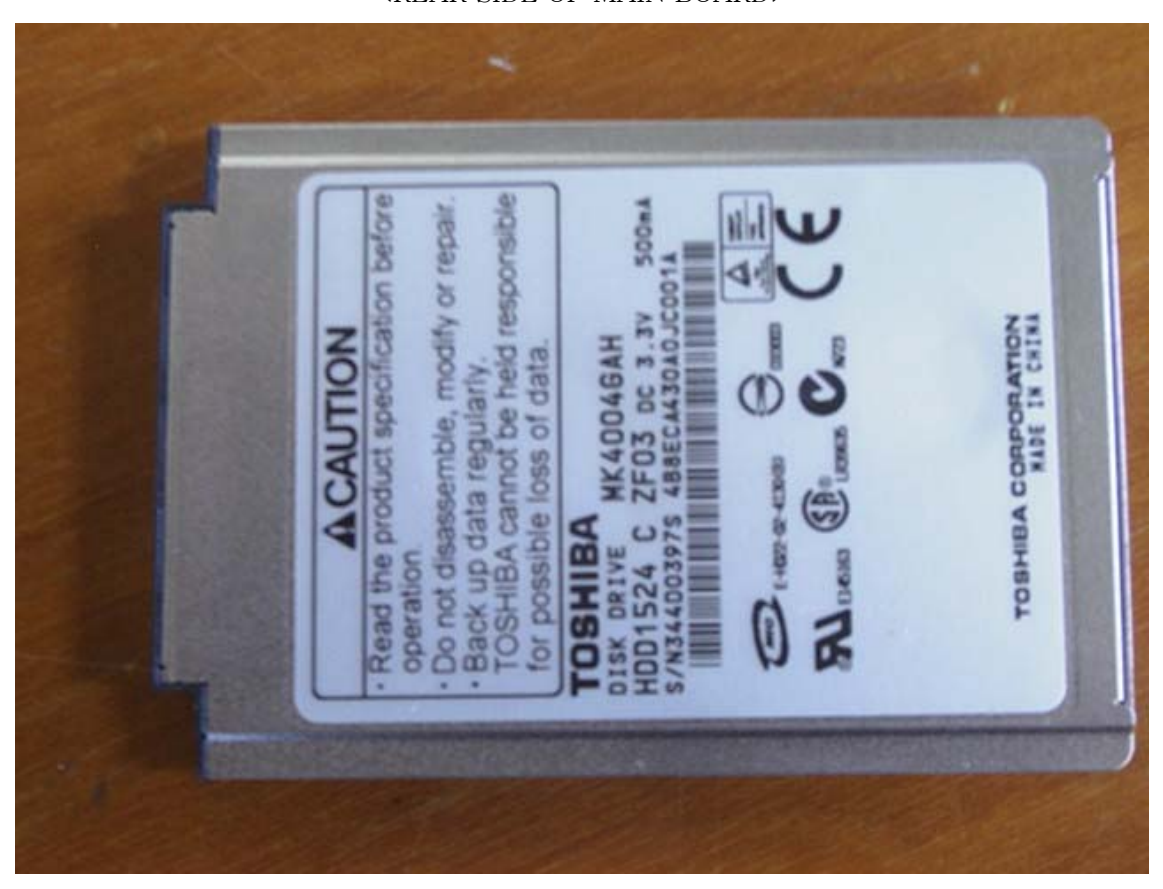
<FRONT SIDE OF HDD>