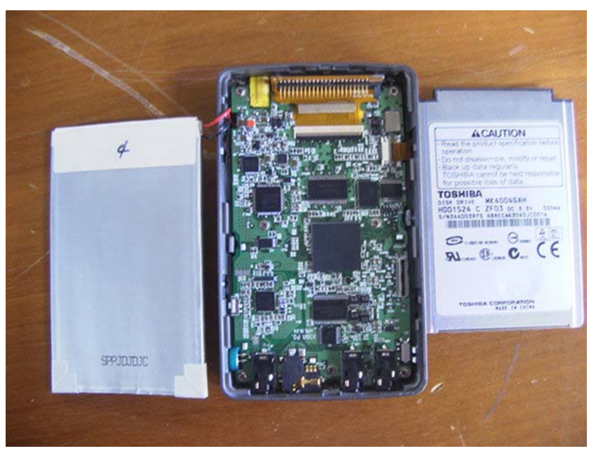
<INNER SIDE OF EUT>