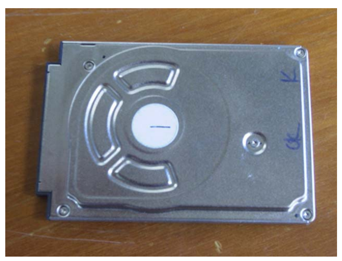
<REAR SIDE OF HDD>