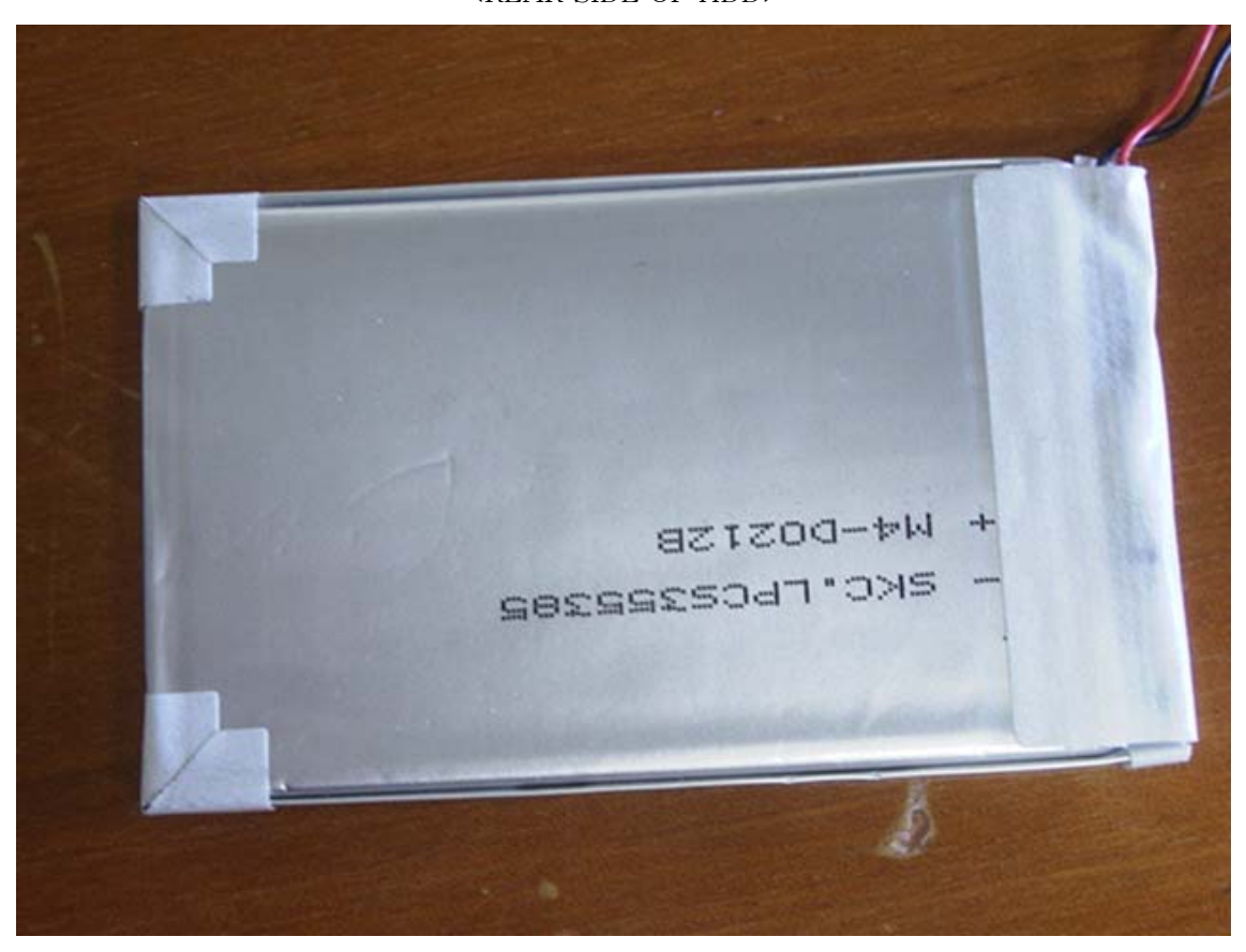
< FRONT SIDE OF BATTERY>