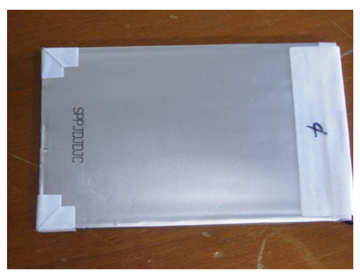
< REAR SIDE OF BATTERY>