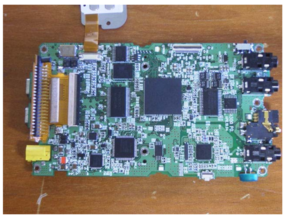
<REAR SIDE OF MAIN BOARD>