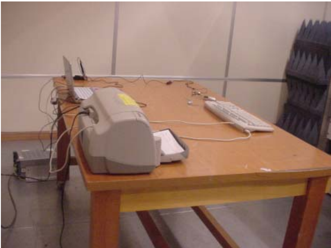
<SIDE PHOTO OF CONTINUOUS DISTURBANCE VOLTAGE >