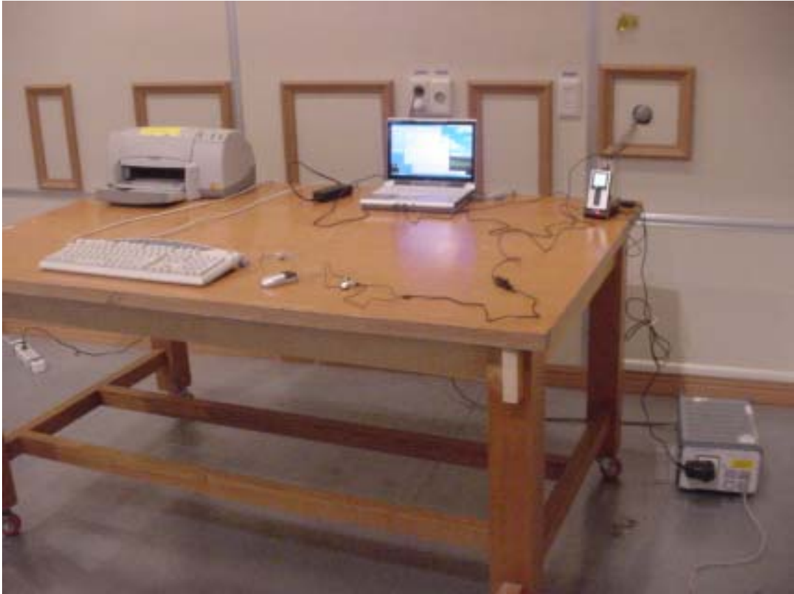
<FRONT PHOTO OF CONTINUOUS DISTURBANCE VOLTAGE >