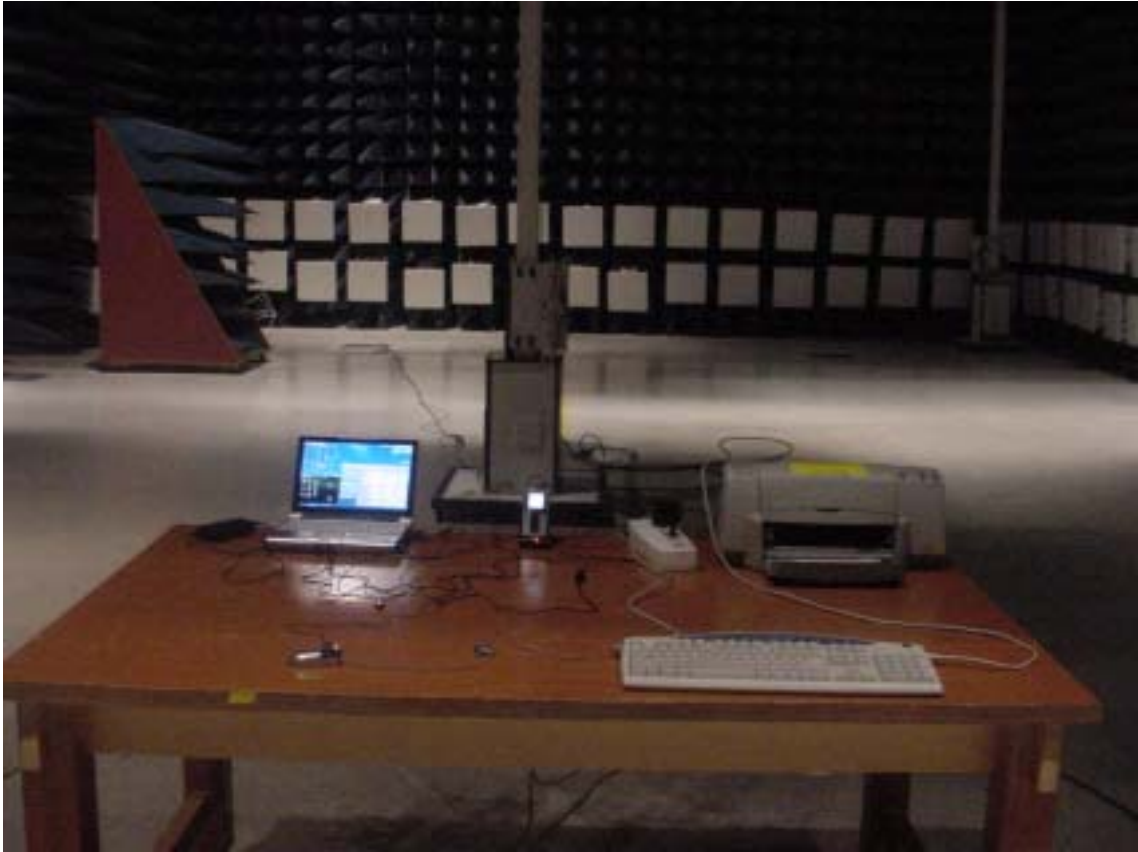
<FRONT PHOTO OF RAIDIED DISTURBANCE >