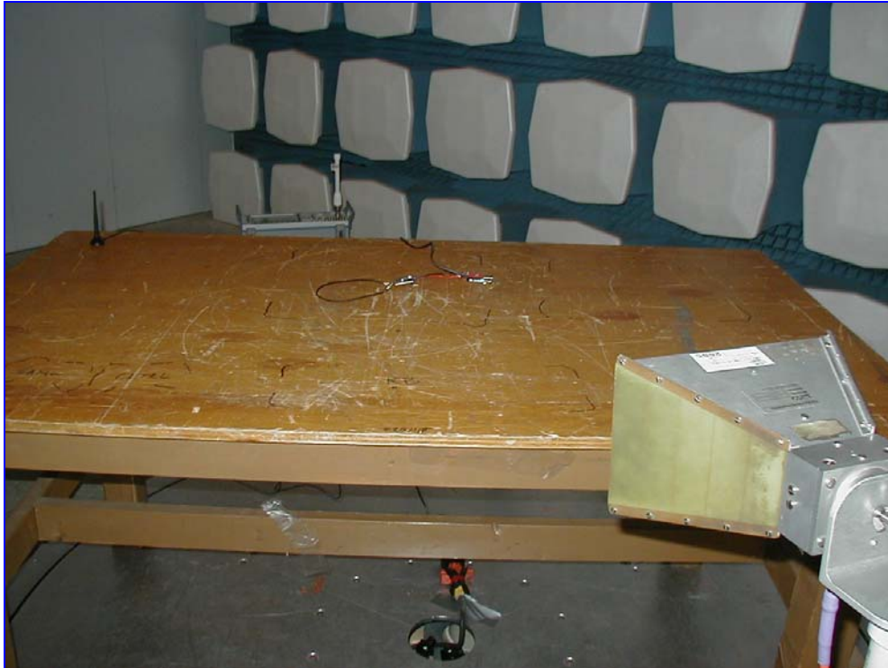
Photograph 3. Radiated Emission Limits Test Setup