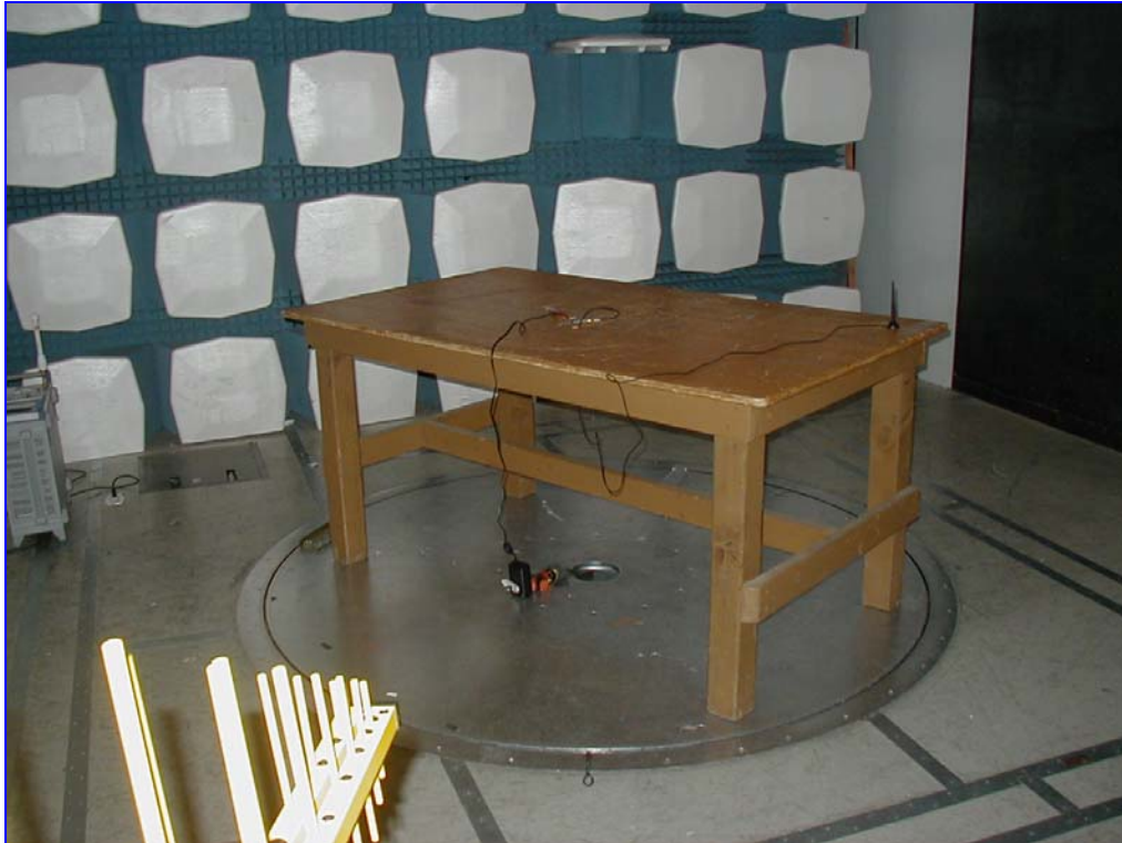
Photograph 1. Radiated Emission Limits Test Setup