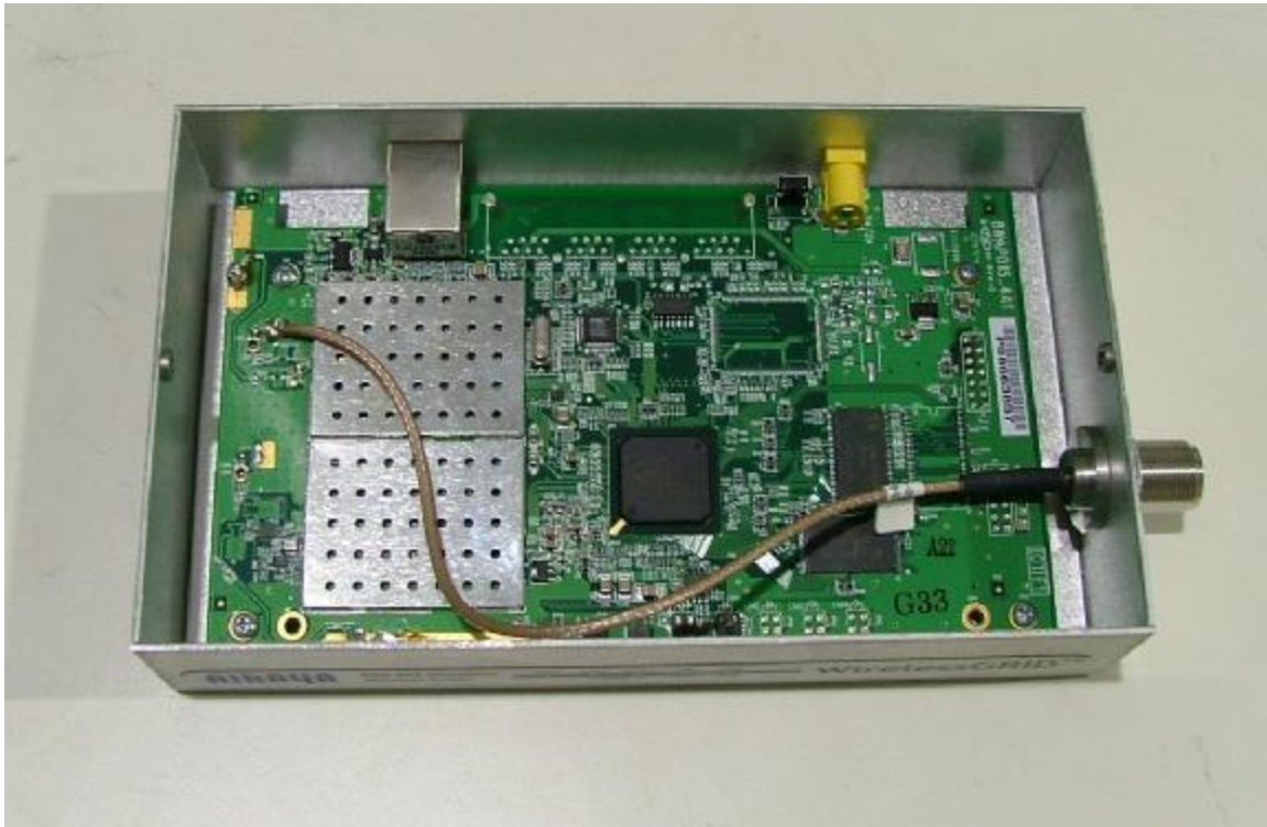
Internal Photo 1: Top without cover