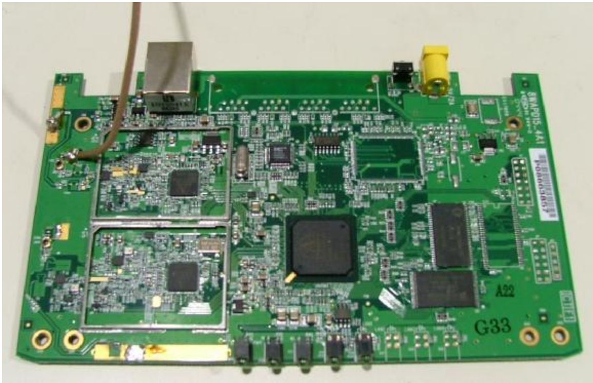
Internal Photo 3: PCB Top without shielding