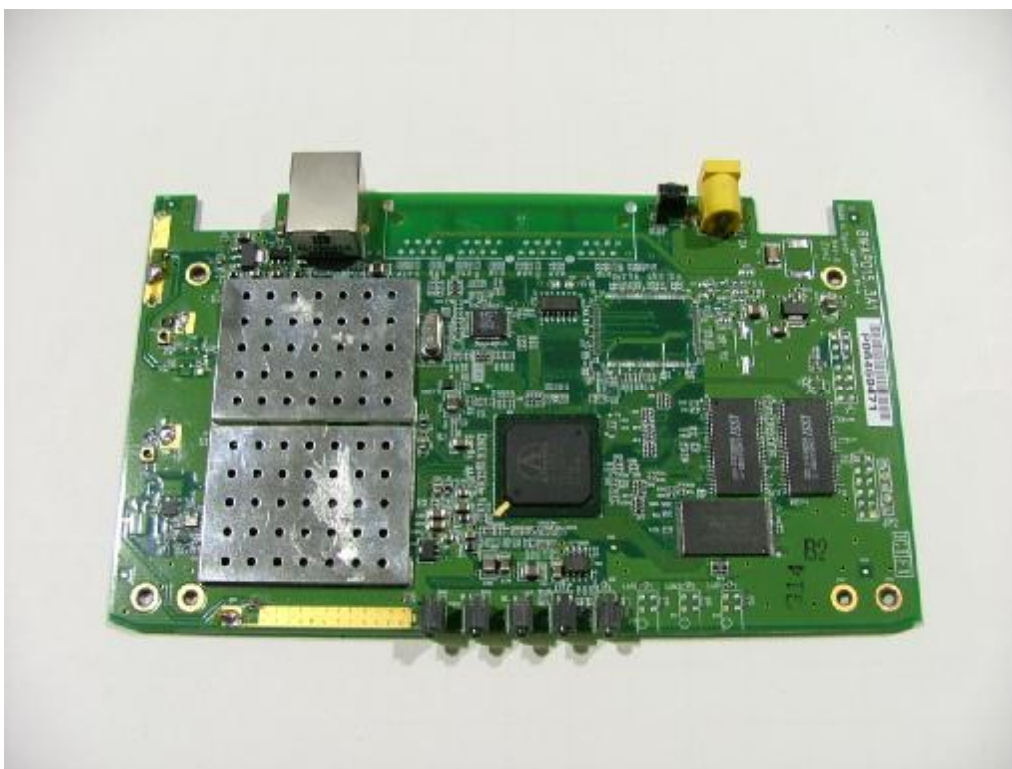
Top without absorber