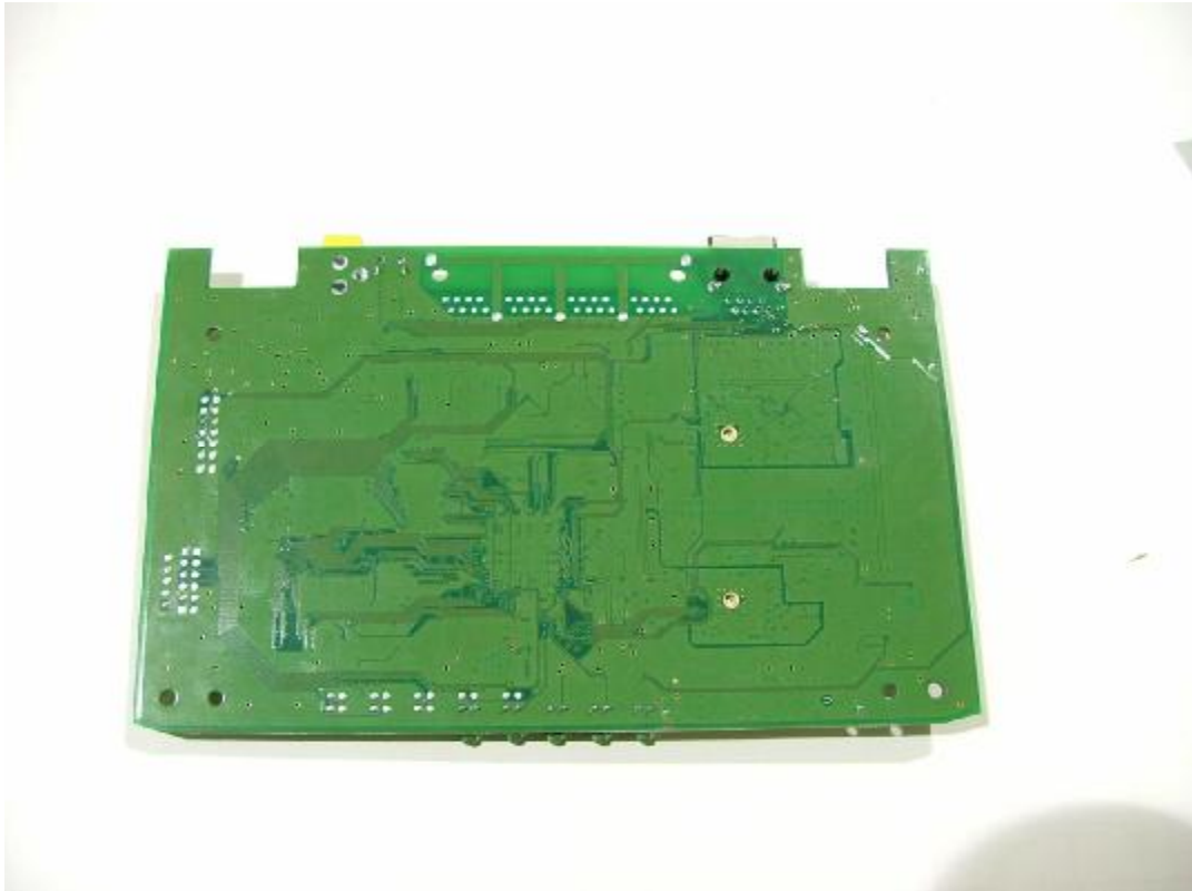
Bottom without absorber