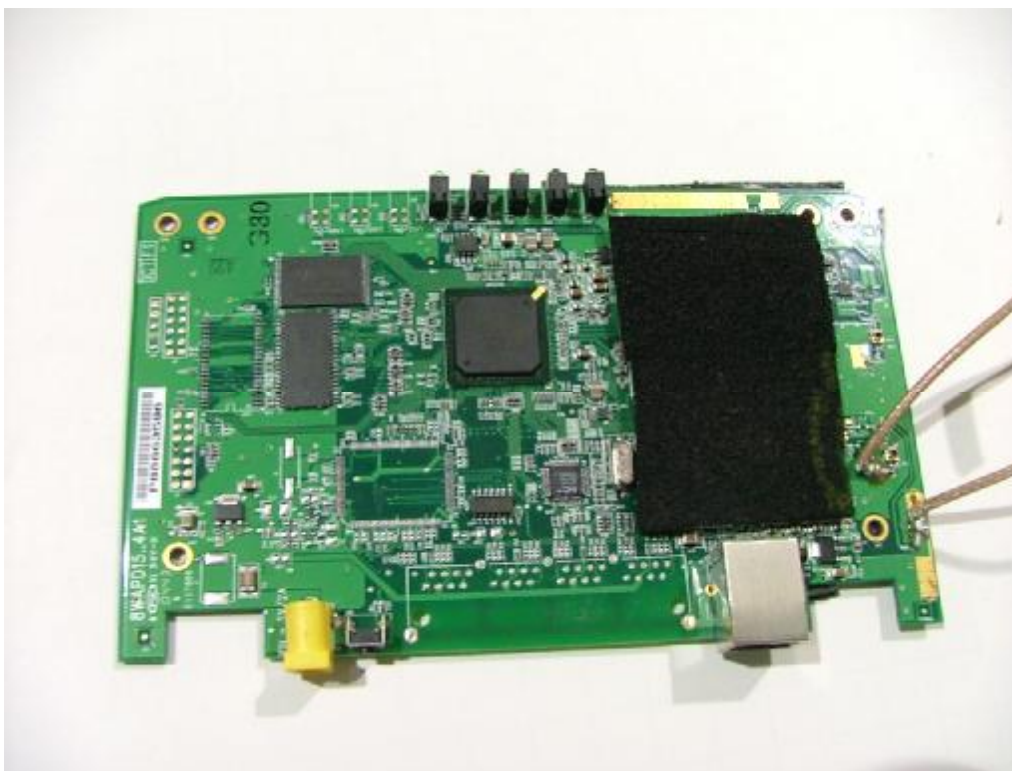
Top with absorber