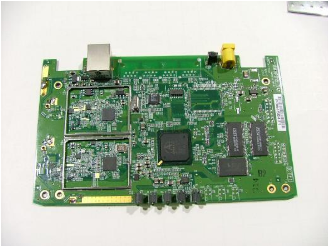
Top without shield