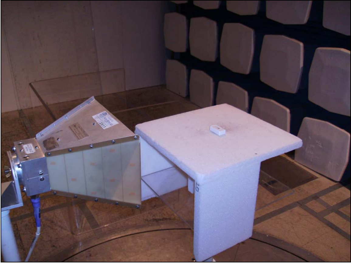
Photograph 1. 10 dB Test Setup