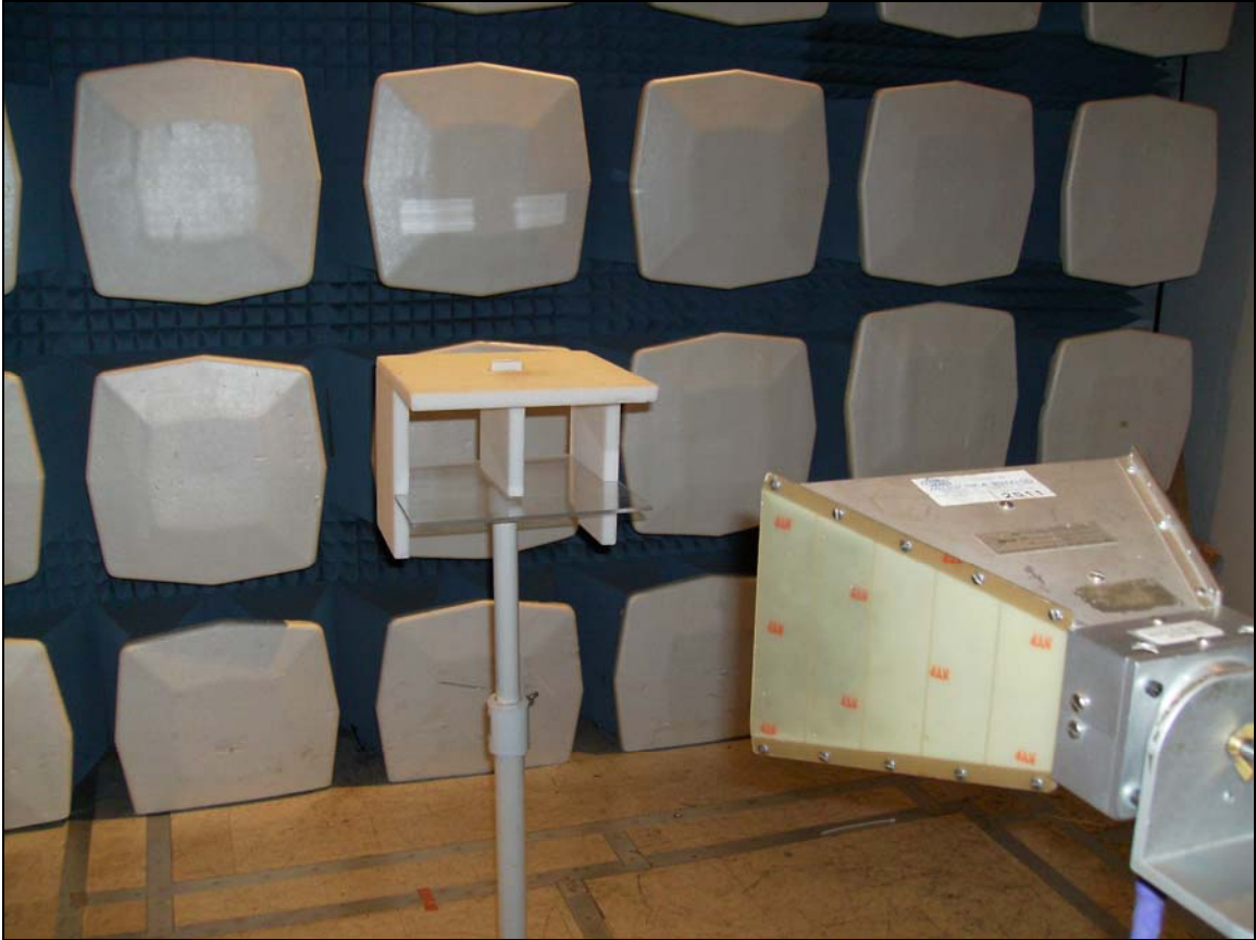
Photograph 3. Peak Emissions, Test Setup