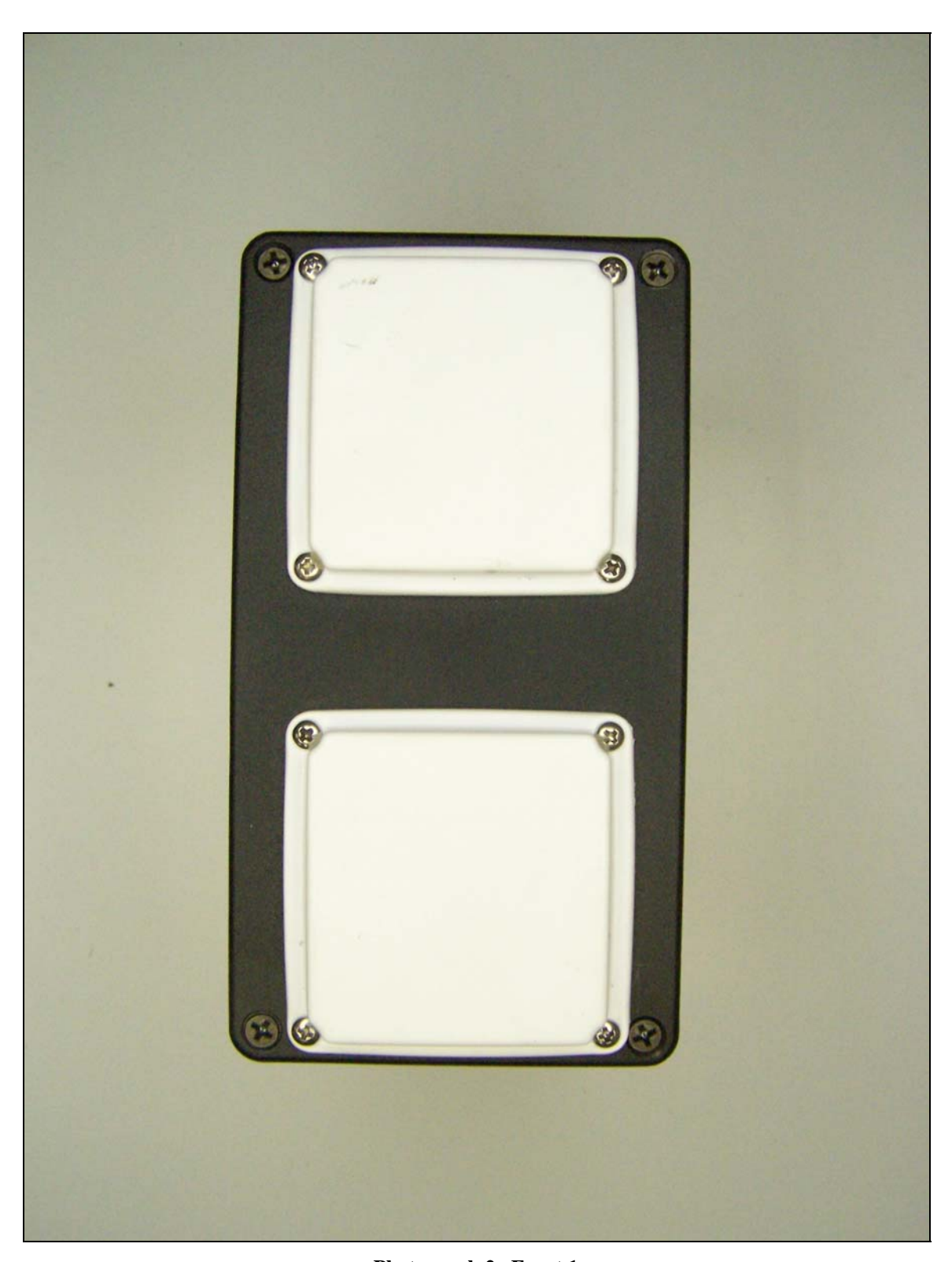
Photograph 2. Front 1