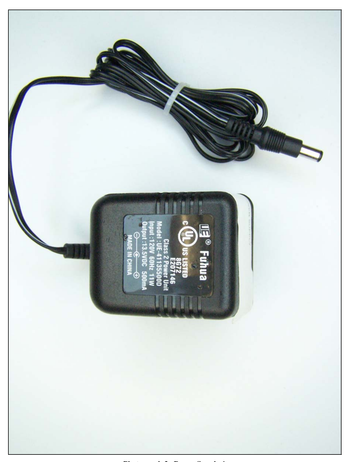
Photograph 3. Power Supply 1