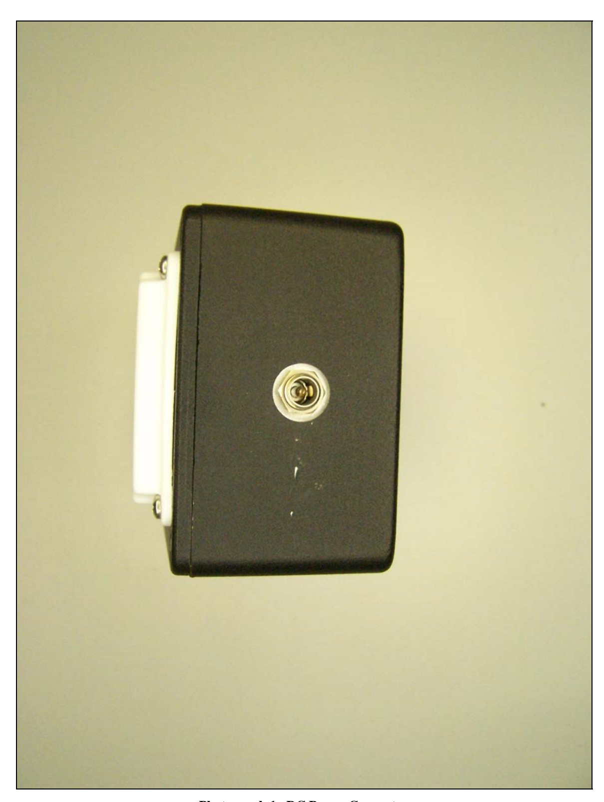
Photograph 1. DC Power Connector