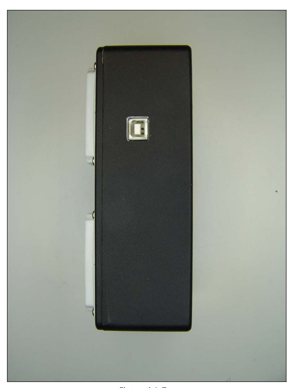
Photograph 6. Top