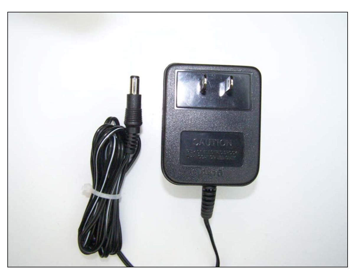
Photograph 4. Power Supply 2