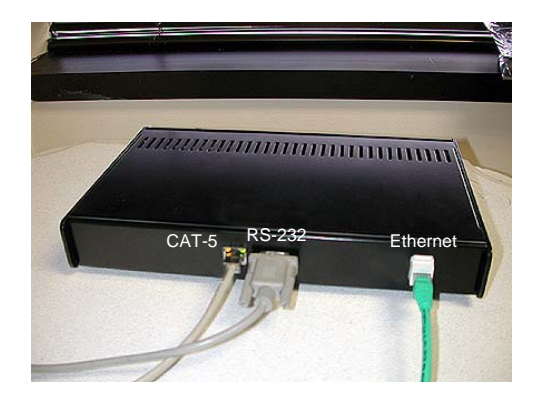
Figure 3. PAL-650 Hub and Power Distribution System.

The Receivers are interconnected (daisy-chained) via CAT-5 cabling, which is also used to provide power to the units from the PAL-650 Hub and Power Distribution System (Figure 3).