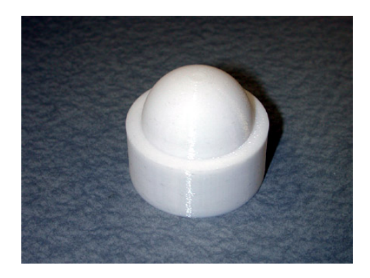
Figure 4. Active PAL-650 Tag.

Once the receivers and hub are installed and interconnected, the PAL-650 tags (cf. Figure 4 below) need to be activated. To do so, remove the metal ring (cf. Figure 5) which attaches the polystyrene protective bottom plate to the tag radome using the special tool provided with the system. Once disassembled, the tag internal battery will be visible. (The tag battery should last at least 5 years in regular service.)