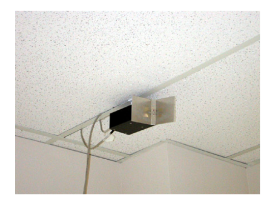
Figure 1. Typical ceiling mount for PAL-650 Receiver. Note placement of directional antenna (pointing inwards).

For optimum performance, the PAL-650 Receiver locations should be chosen so as to provide adequate coverage of the area of interest. Typical ceiling mountings for the Receivers are illustrated in Figures 1 and 2 below.