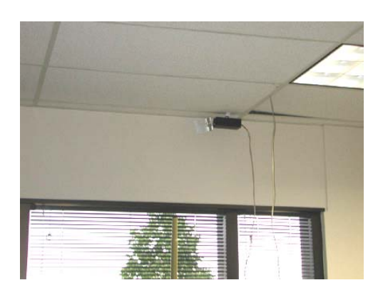
Figure 2. Another typical ceiling mount for PAL-650 Receiver.