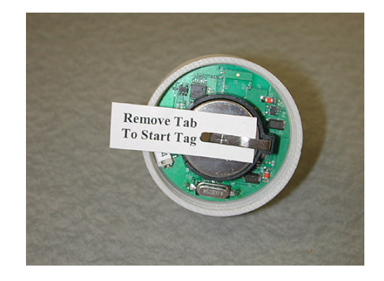
Figure 6. PAL-650 Tag (before power activation).

When delivered, the tags are provided with a protective tab (cf. Figure 6) which disconnects the internal lithium battery from the rest of the tag circuitry. Once this tab is removed, the tag is activated and can then be used for precision localization applications.