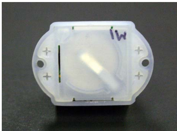
Plastic Housing (Top and Bottom Views)