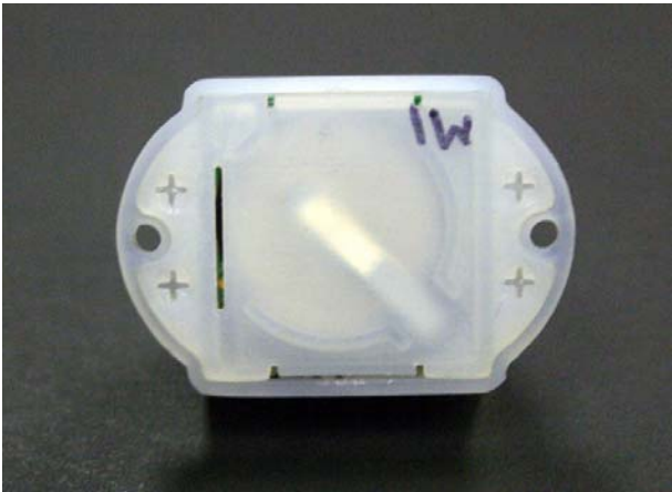
Plastic Housing (Top and Bottom Views)