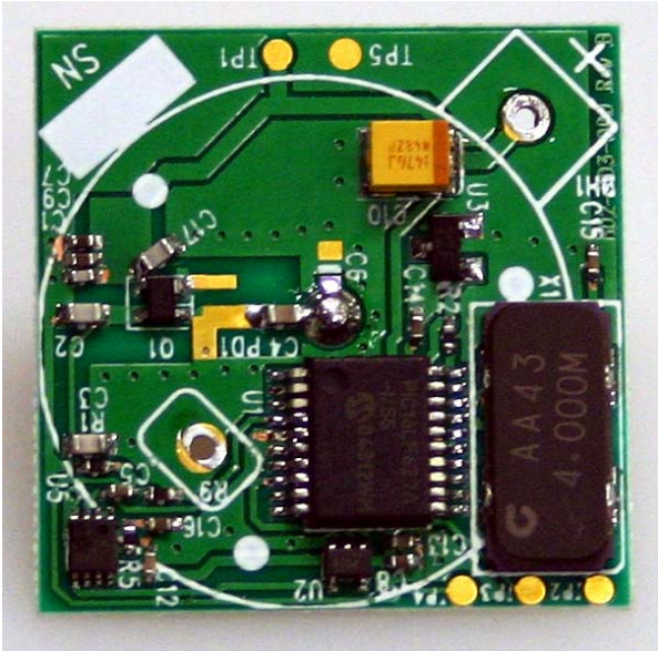
Circuit Side of Printed Circuit Board (w/o battery holder)