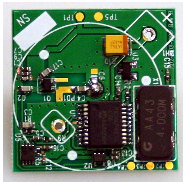
Circuit Side of Printed Circuit Board (w/o battery holder)