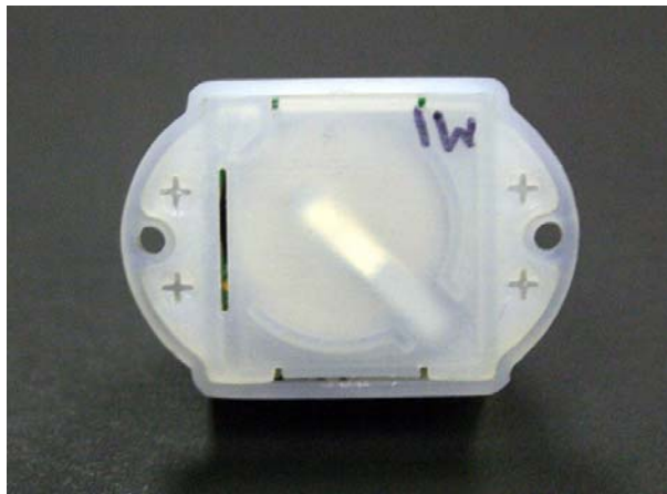
Plastic Housing (Top and Bottom Views)