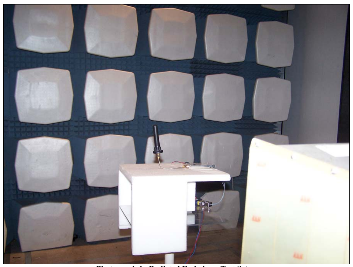
Photograph 1. Radiated Emissions, Test Setup