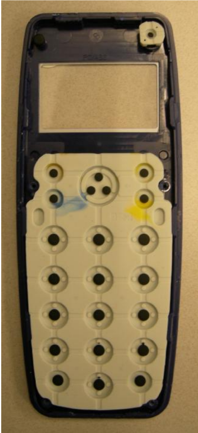
Top cover of Response PE (inside view).