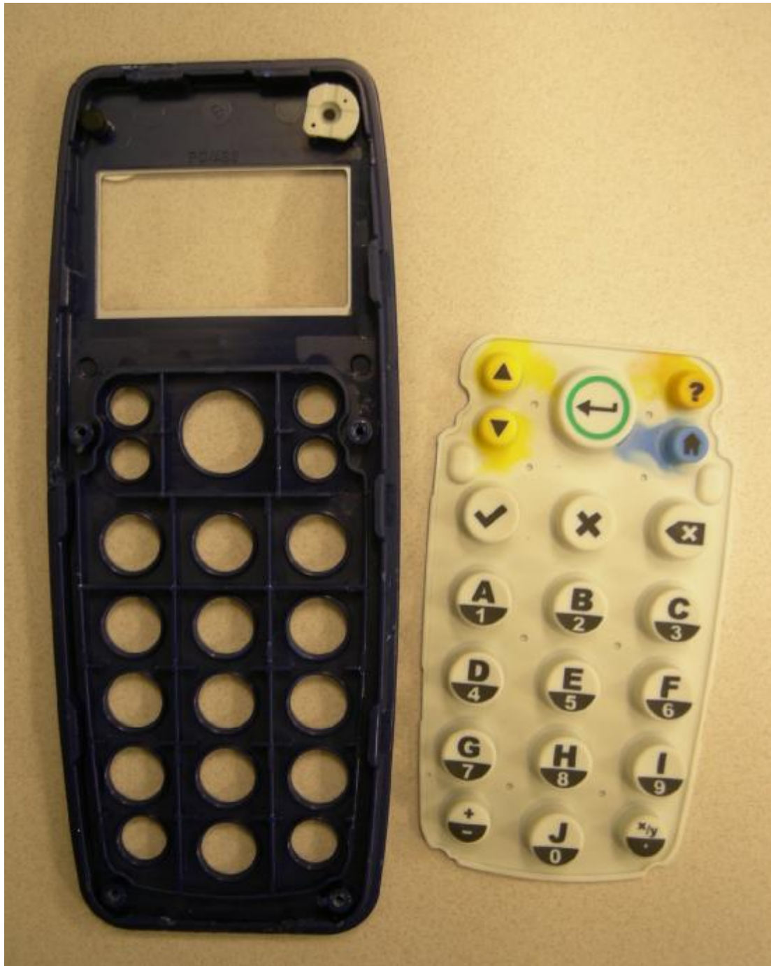
Top cover of Response PE (inside view, with keypad removed).