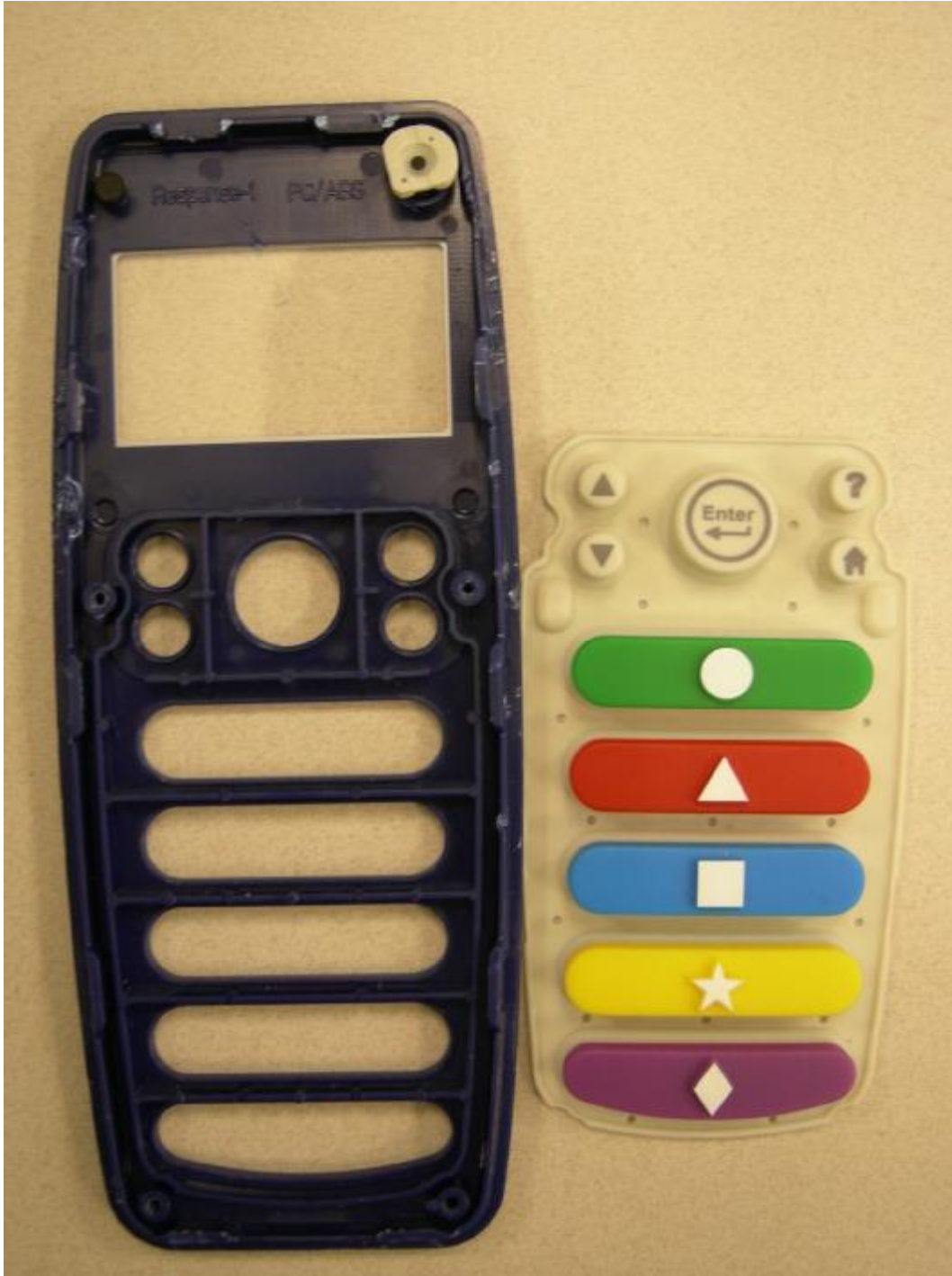
Top cover of Response LE (inside view, with keypad removed).