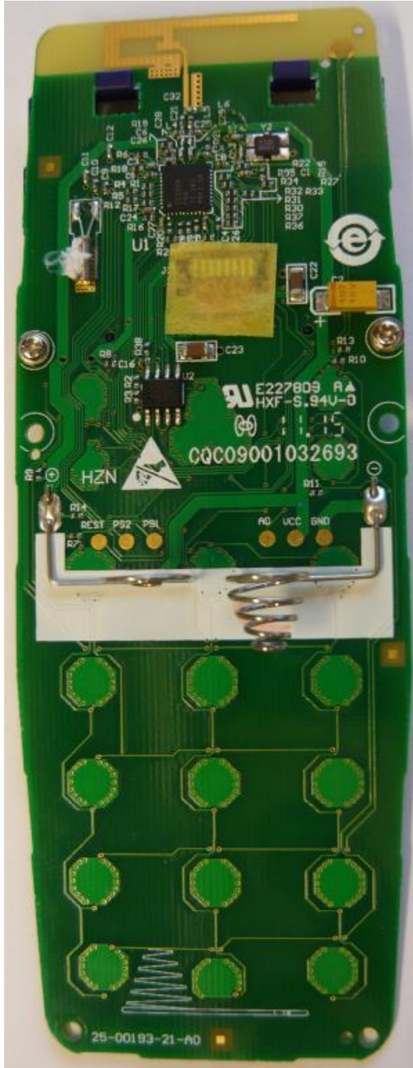
Bottom of PCBA as viewed with back cover removed. PCBA is removed from front cover.