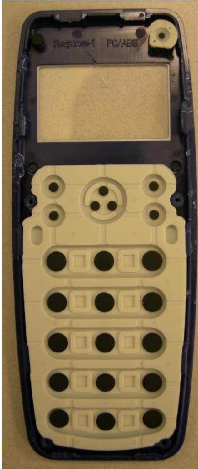
Top cover of Response LE (inside view).