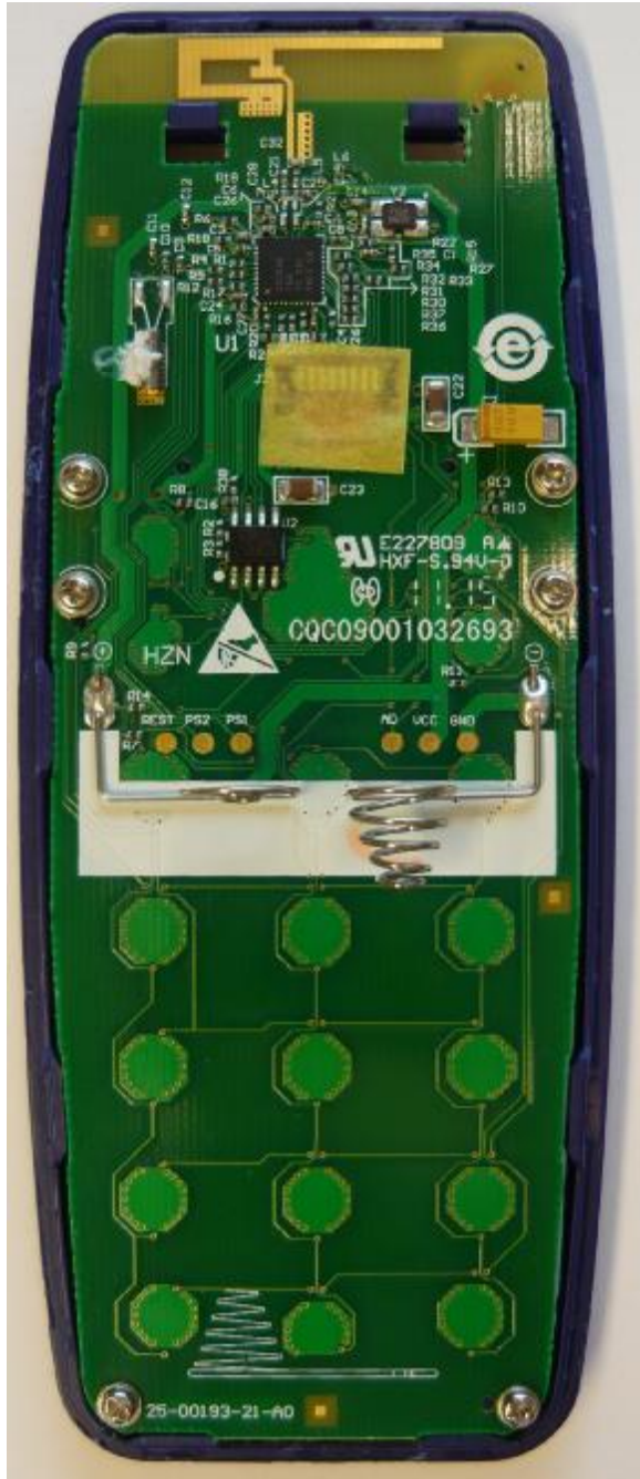
Bottom of PCBA as viewed with back cover removed. PCBA is screwed to front cover.