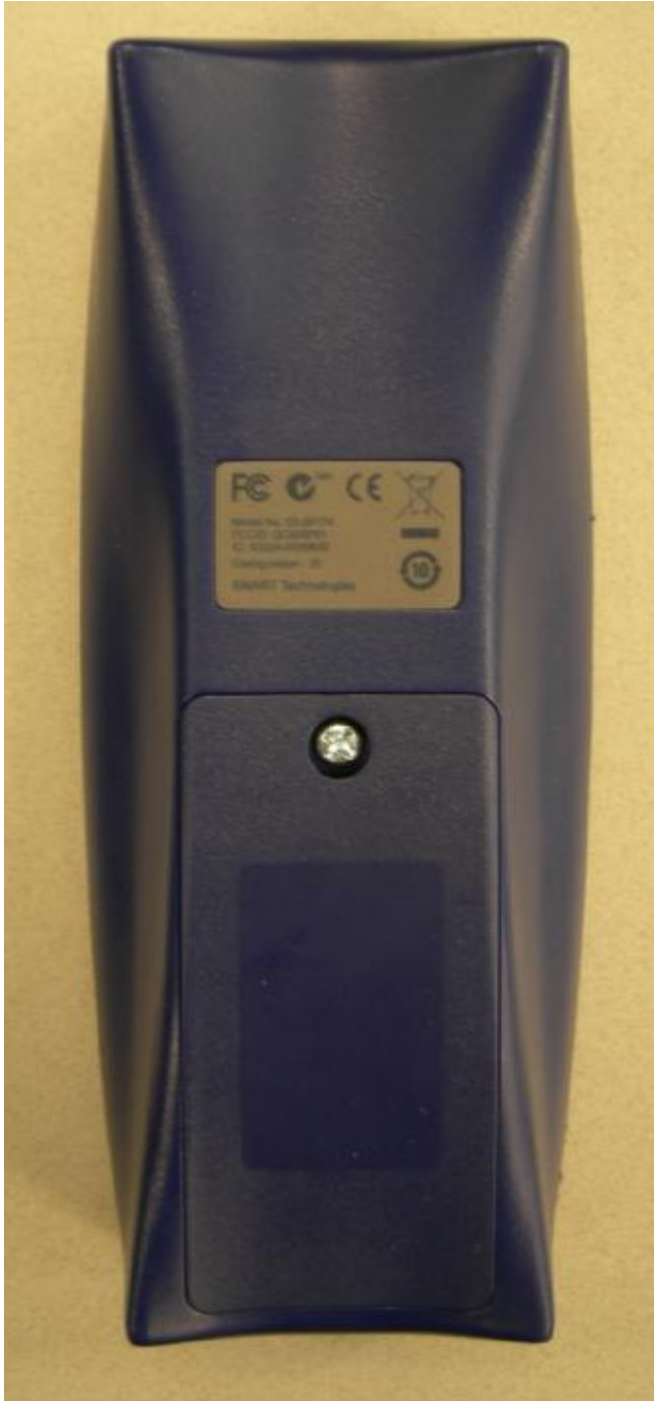
Back of response PE fully assembled.