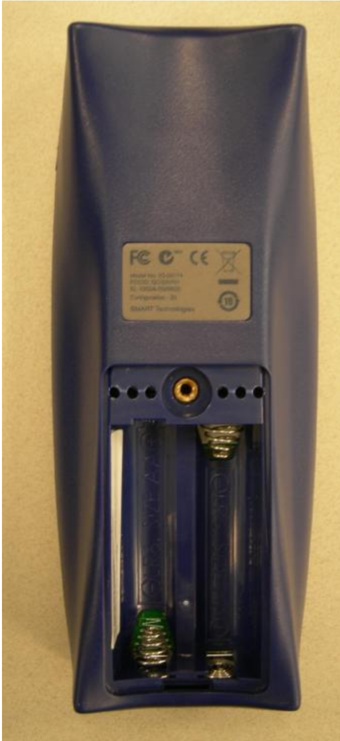
Back of Response PE with battery cover removed.