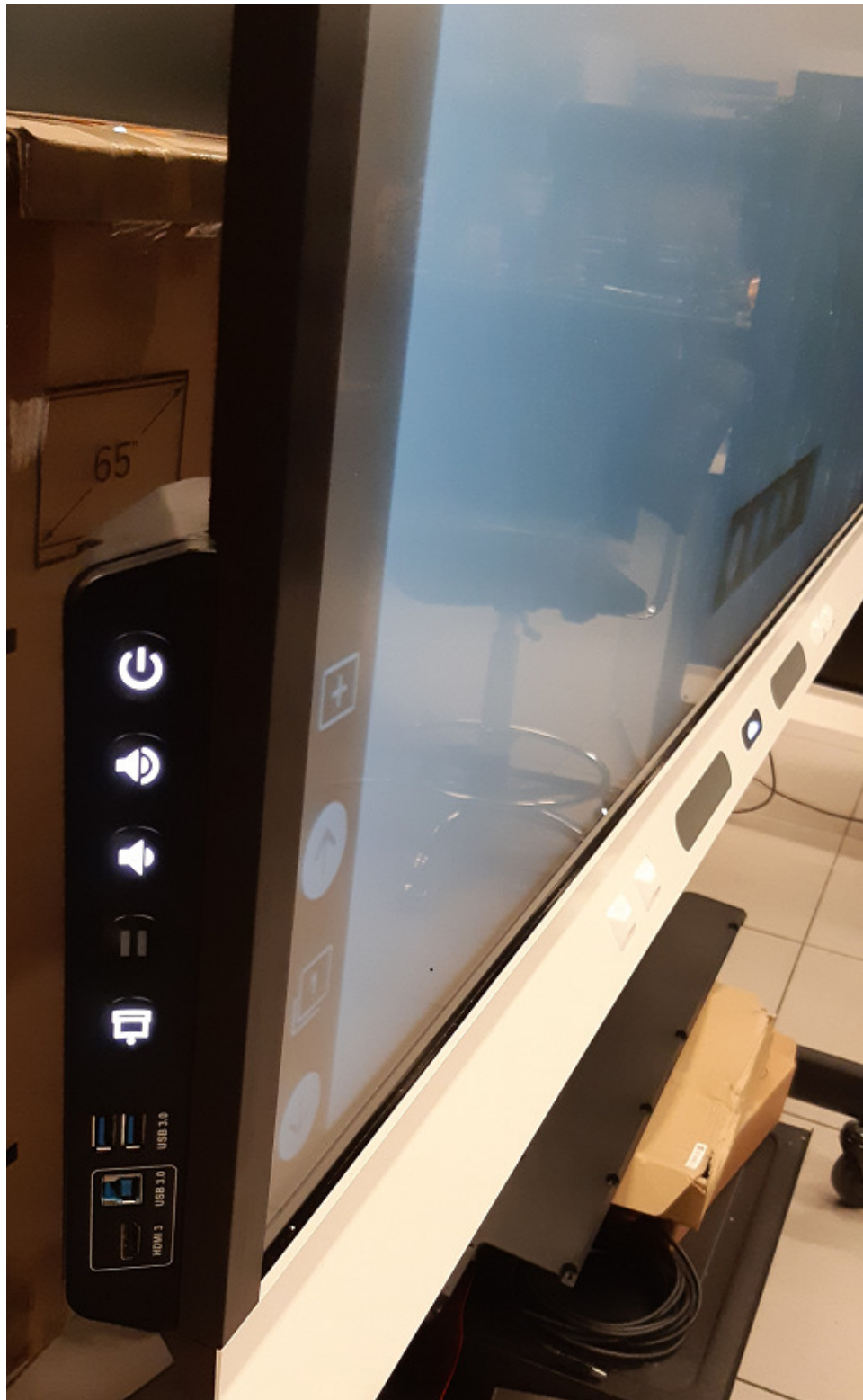
Left Hand Side View (Controller)