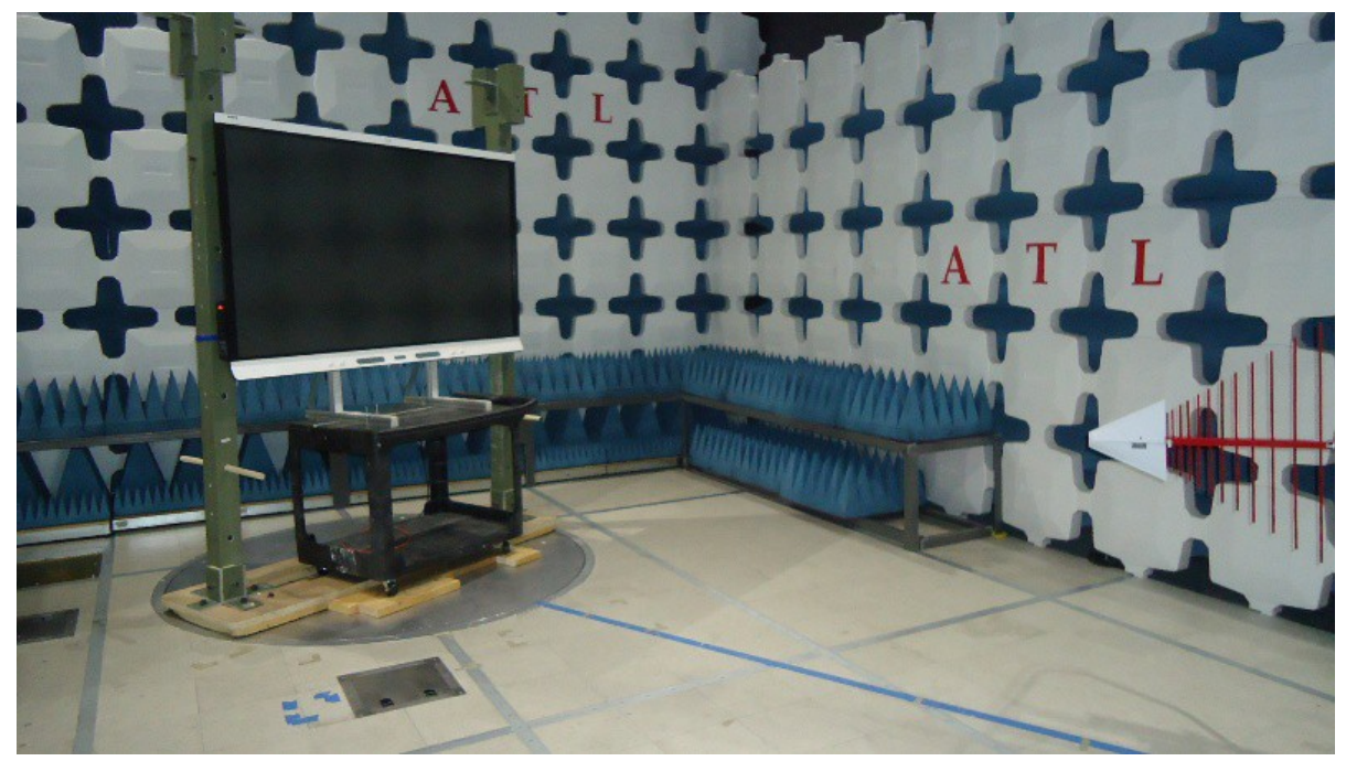
Figure 4.1 - Test Setup - Side View