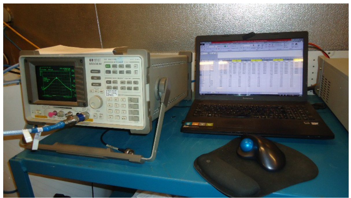
Figure 5.1 - Test Setup - Measurement system