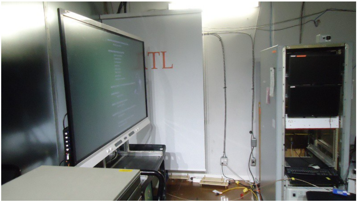
Figure 2.1 - Test Setup - Side View