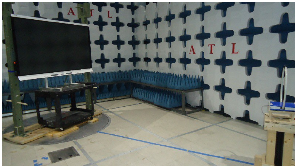
Figure 1.1 - Test Setup - Side View