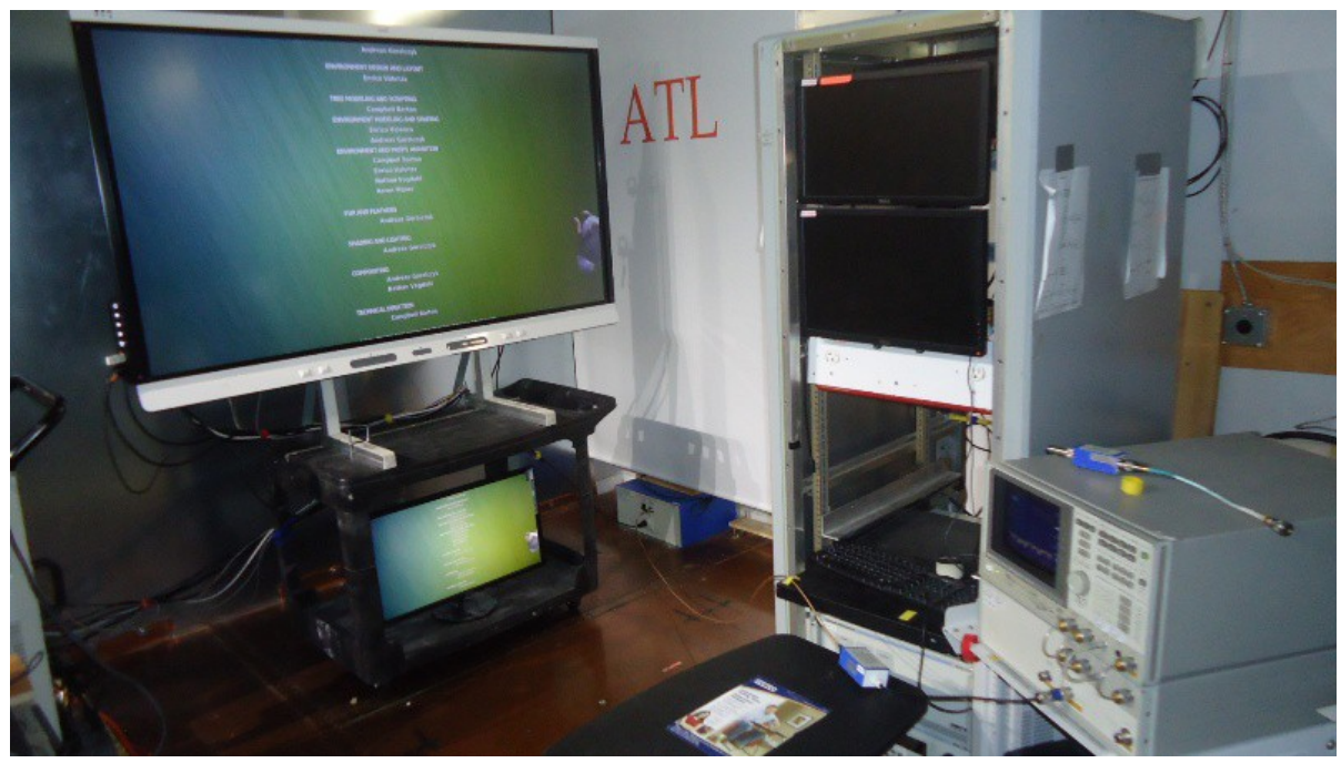
Figure 2.0 - Test Setup - Front View