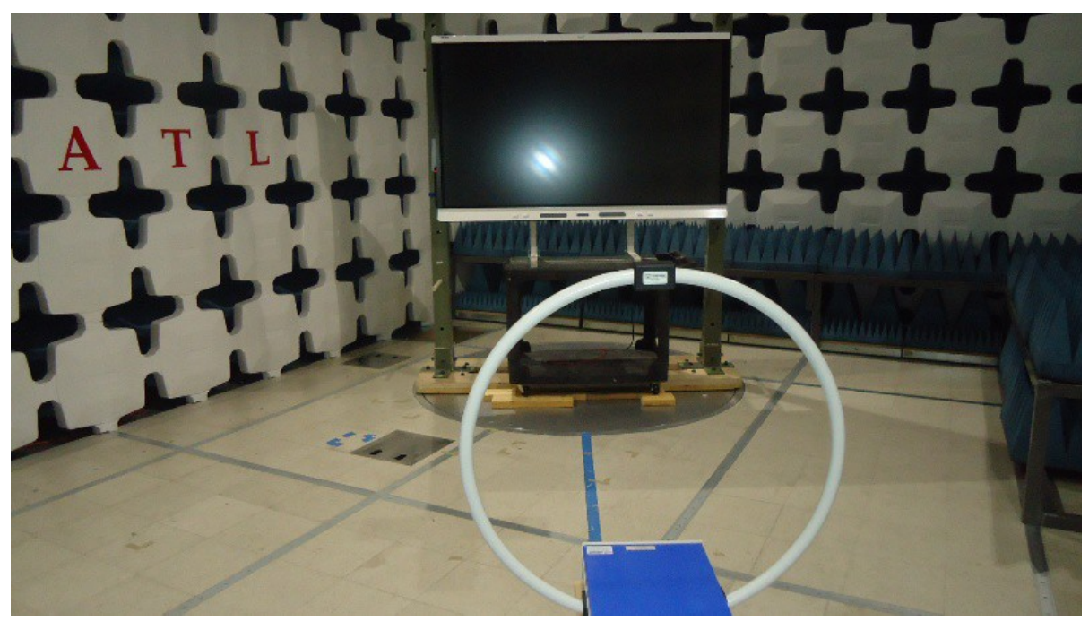
Figure 3.0 - Test Setup - Front View

3.0 Test Setup Photographs Radiated Spurious Emissions(0.009MHz – 30MHz)