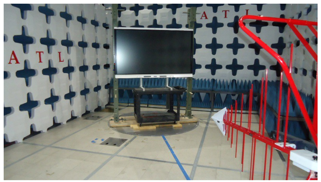
Figure 4.0 - Test Setup - Front View

4.0 Test Setup Photographs Radiated Spurious Emissions(30MHz – 1000MHz)