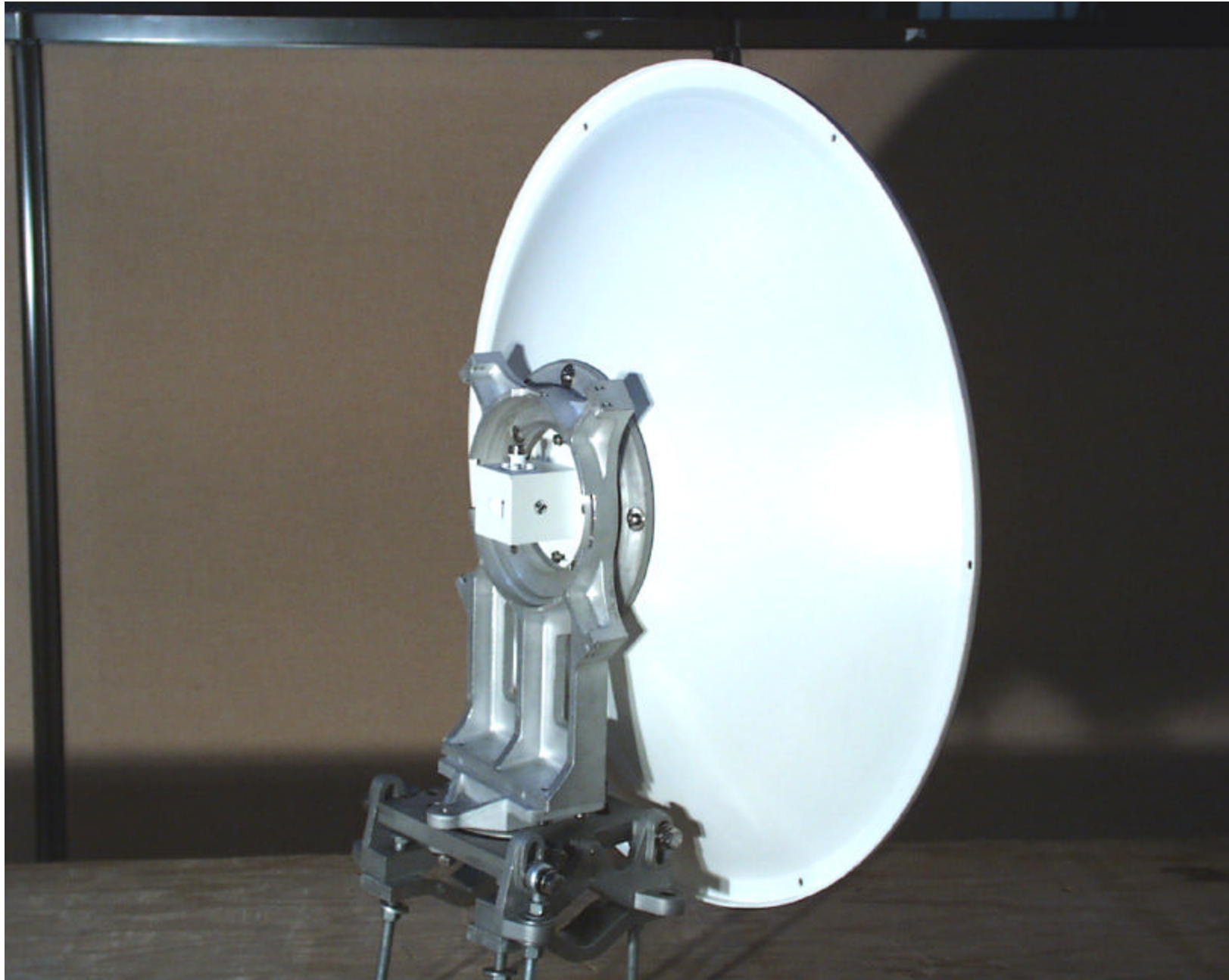
Radiowave Antenna, P/N: SP2-5.2NS, Gain 29 dBi (Back)