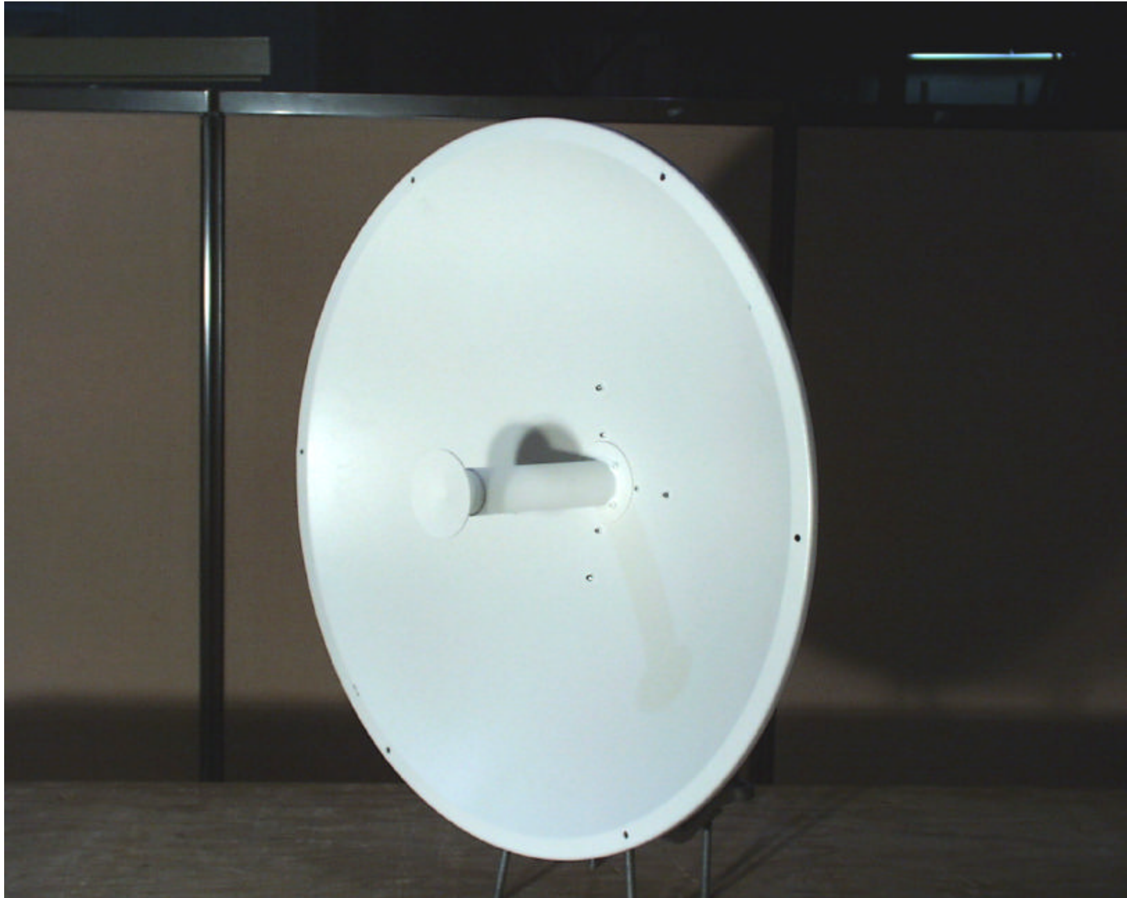
Radiowave Antenna, P/N: SP2-5.2NS, Gain 29 dBi (Front)