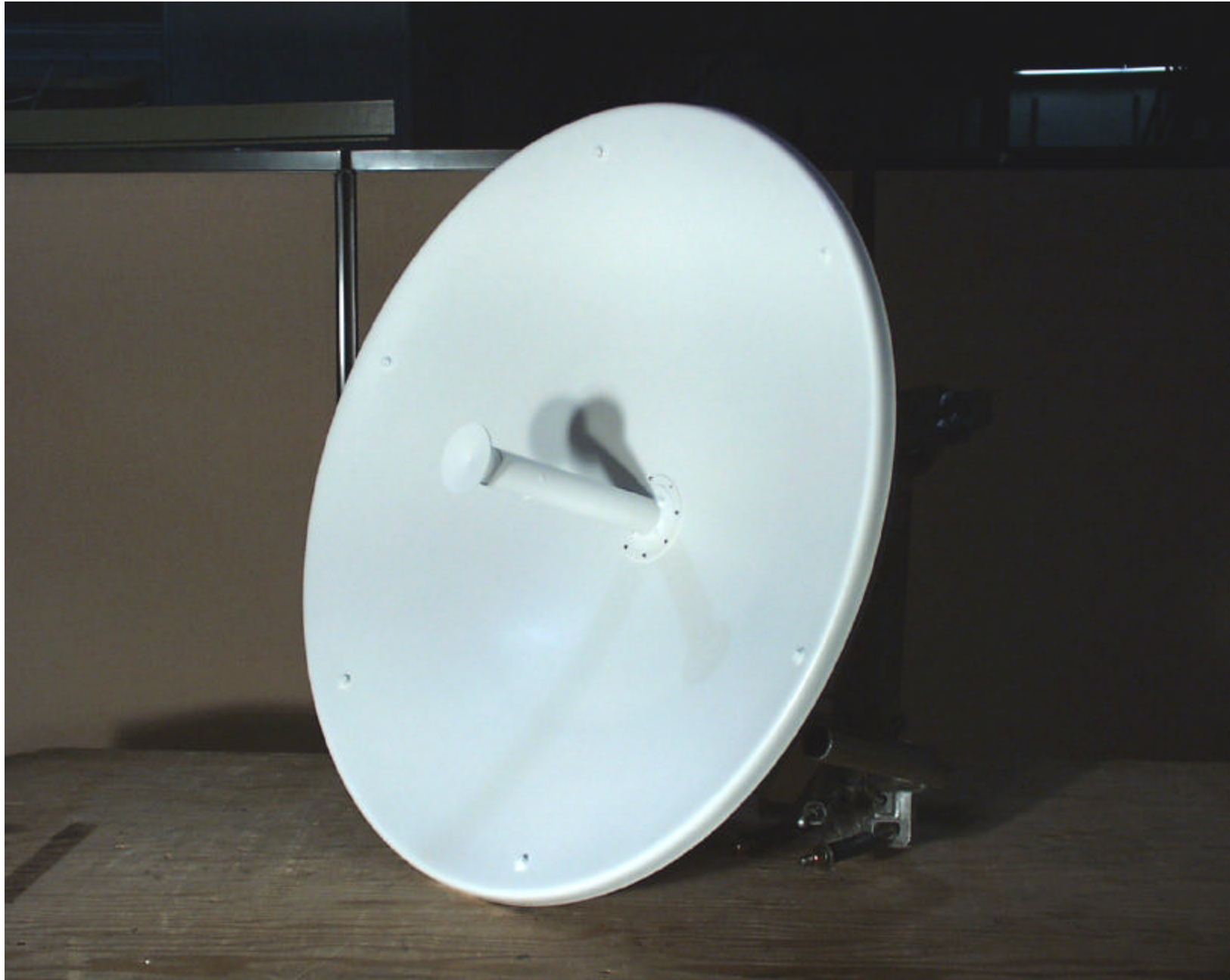
Radiowave Antenna, P/N: SP3-5.2NS, Gain 31.2 dBi (Front)