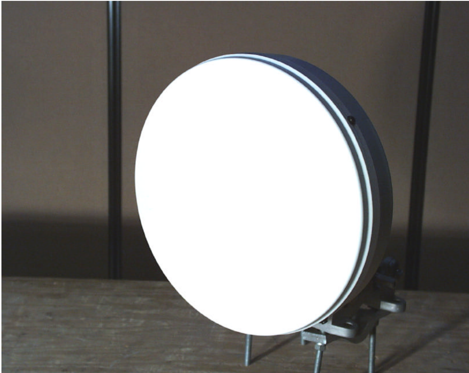
Radiowave Antenna, P/N: SP1-5.2NS, Gain 22.5 dBi (Front)