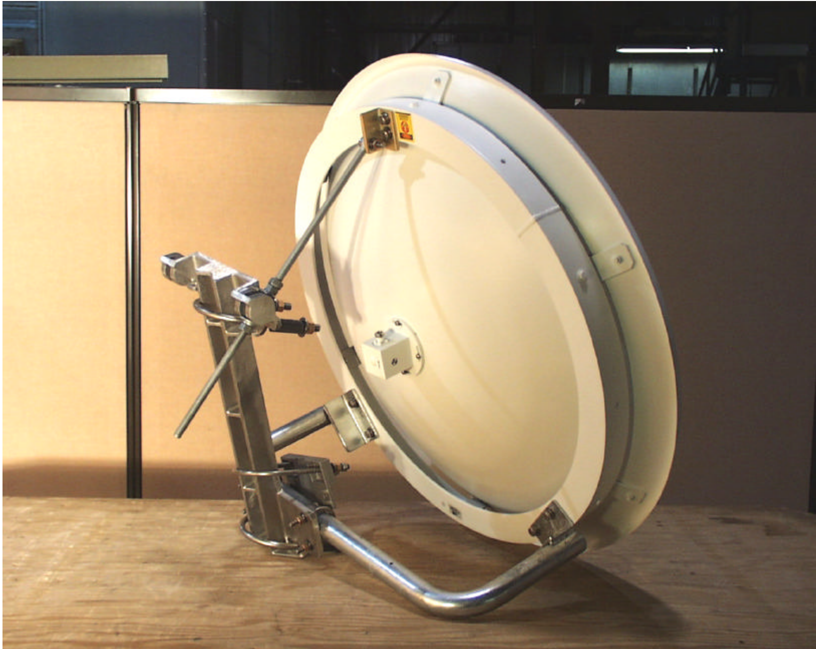
Radiowave Antenna, P/N: SP3-5.2NS, Gain 31.2 dBi (Back)