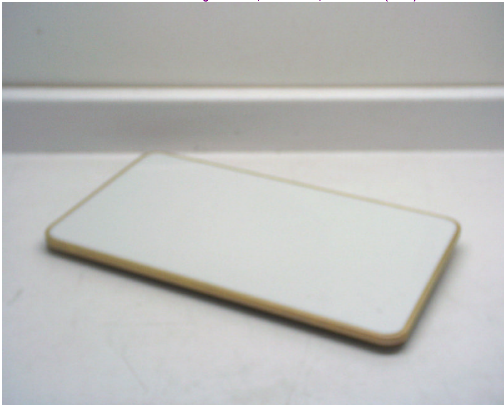
MTI Wireless Edge Antenna, P/N: 484026, Gain: 15 dBi (Front)