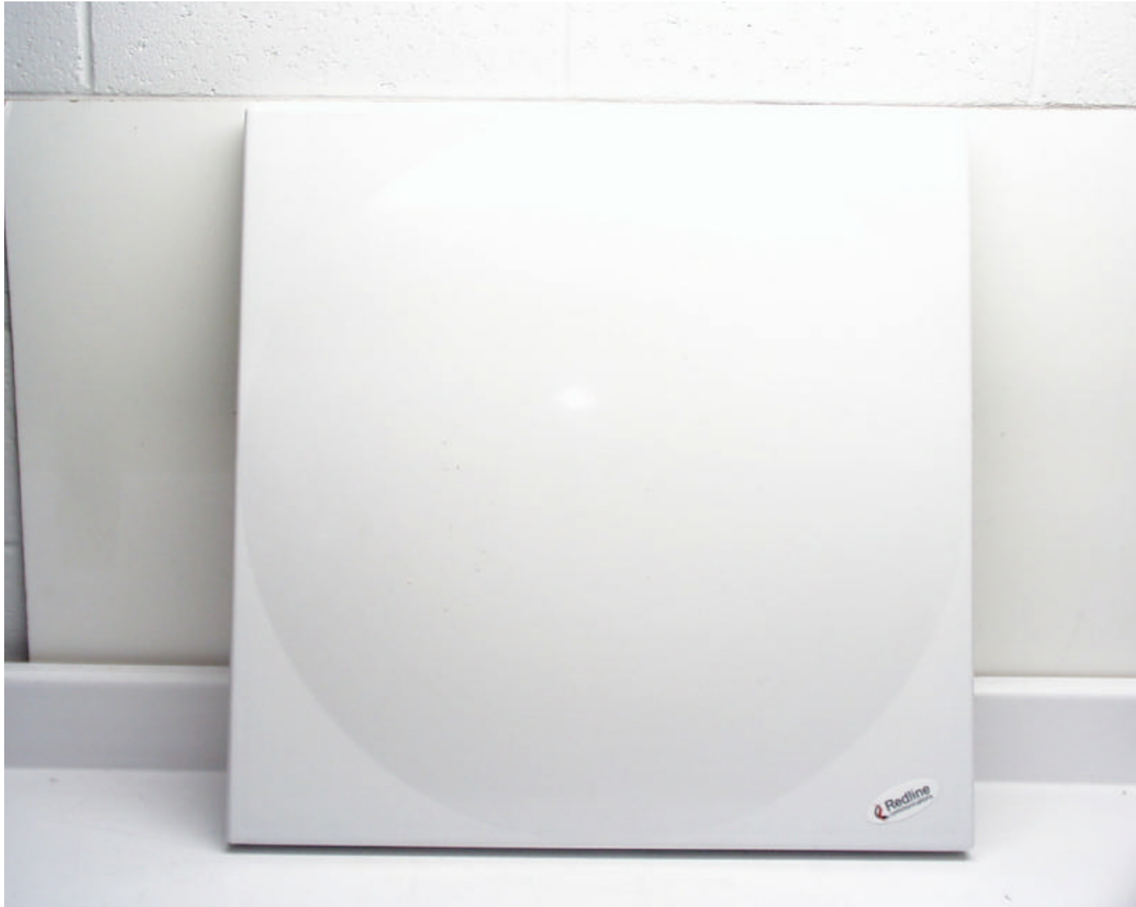
MTI Wireless Edge Antenna, P/N: 486001, Gain: 28 dBi (Front)