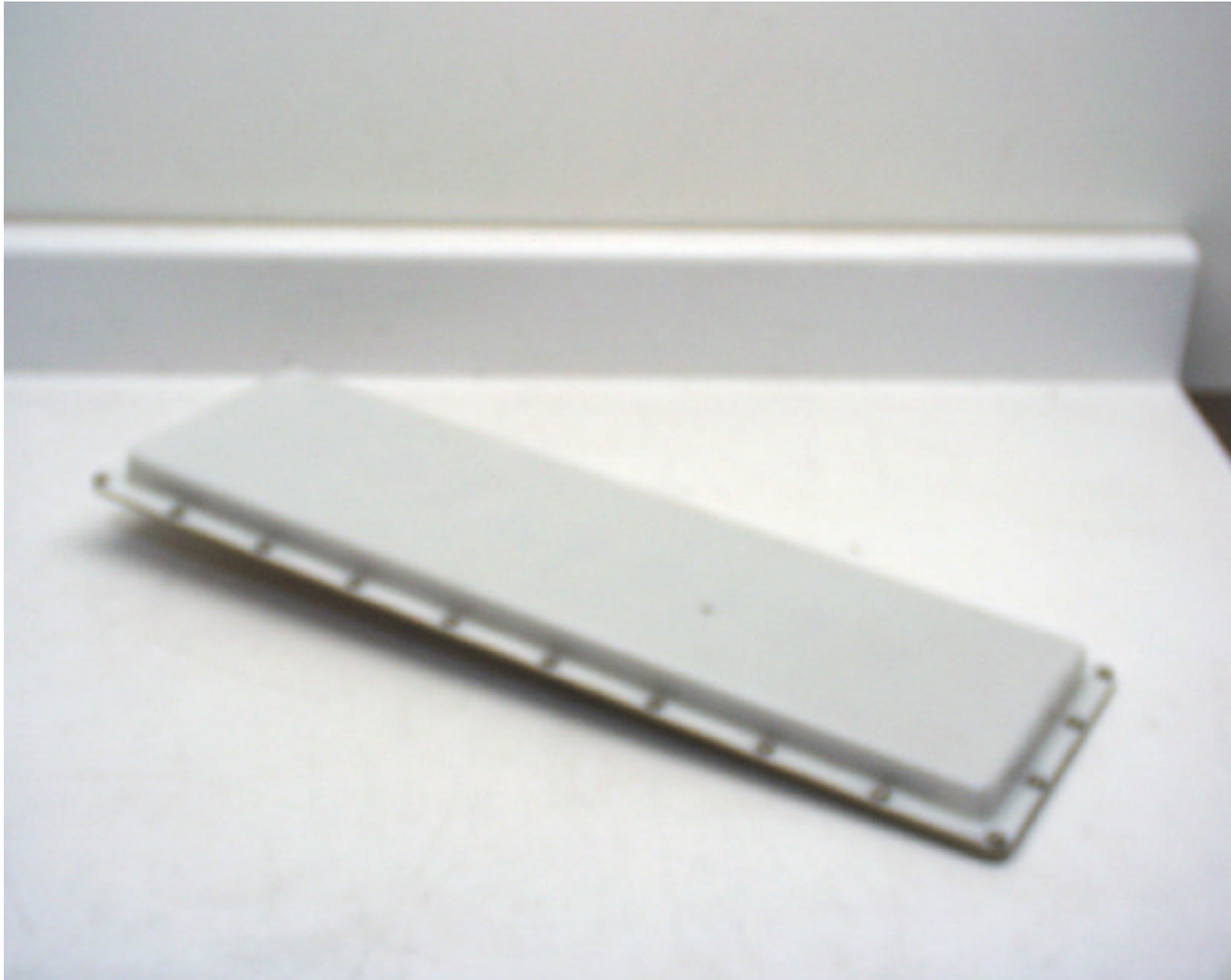
MTI Wireless Edge Antenna, P/N: 484025, Gain: 14 dBi (Front)