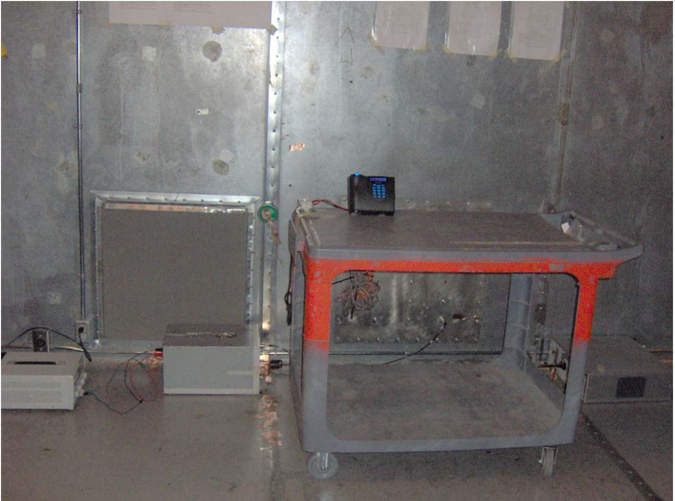
Power Lines Conducted Emissions (front view)