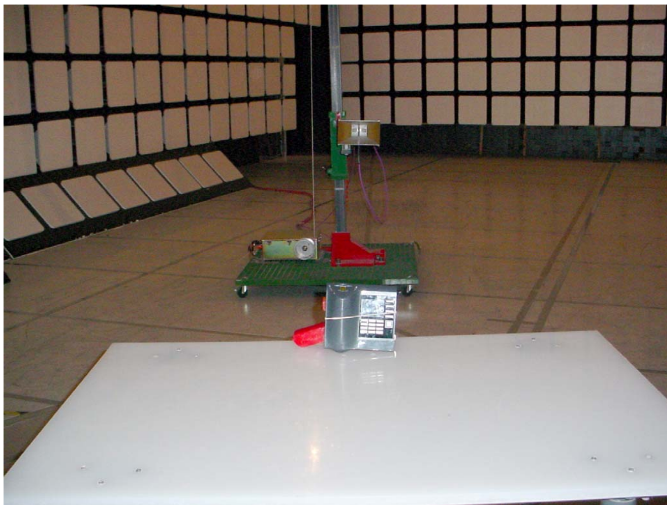
Radiated Emissions at 3m Distance (for frequency above 30 MHz)