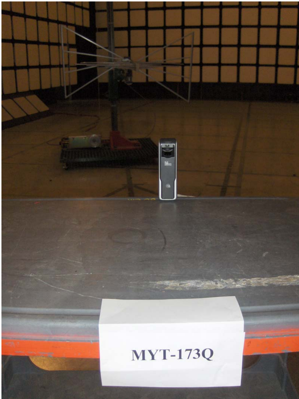
Radiated Emissions at 3 m Distance (30 MHz to 1000 MHz)