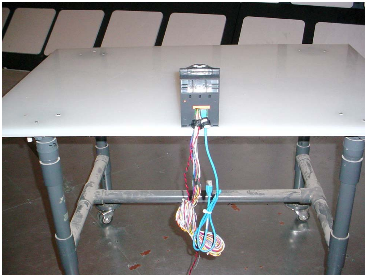
Radiated Emissions at 3m Distance