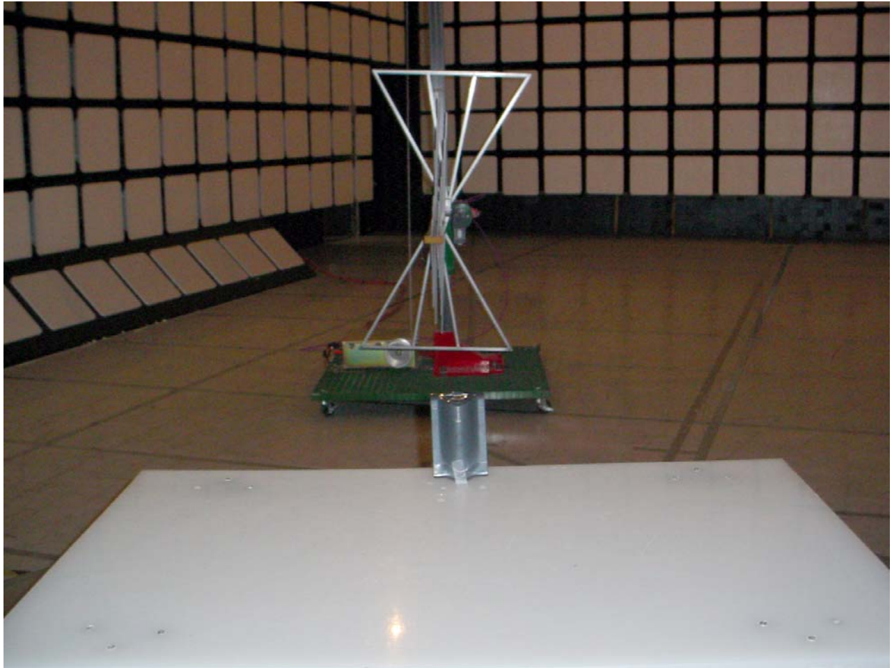
Radiated Emissions at 3m Distance (for frequency above 30 MHz)