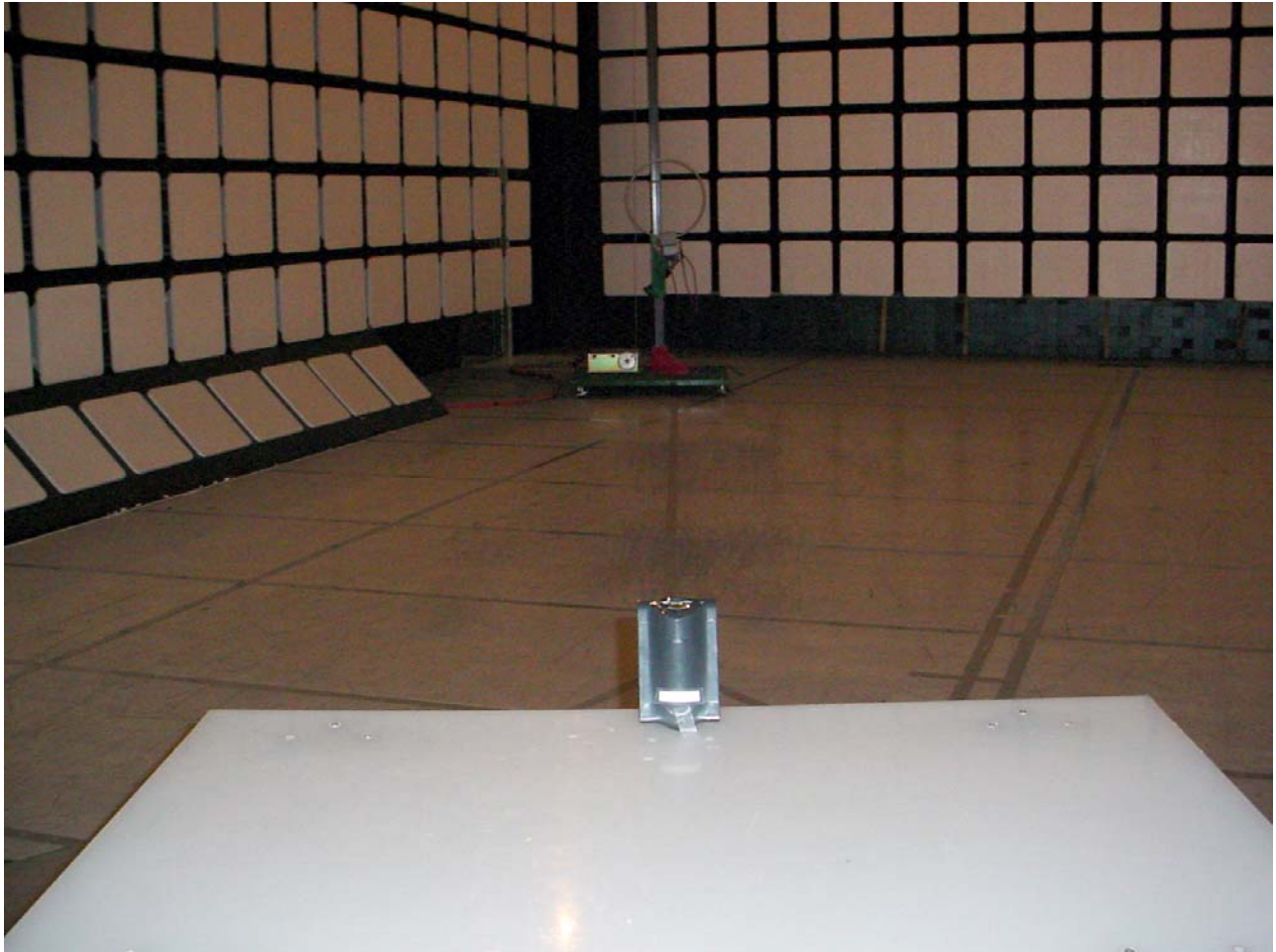
Radiated Emissions at 10m Distance (for frequency below 30 MHz)