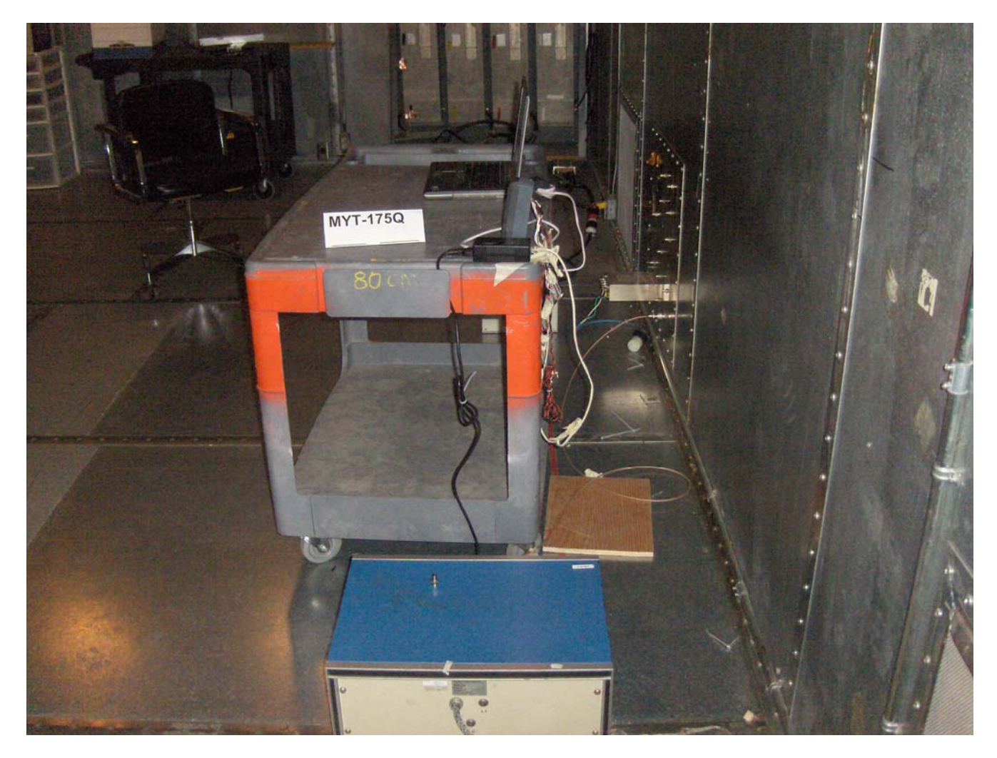
Power Line Conducted Emissions Test Configuration 2: Power over Ethernet (PoE) Injector