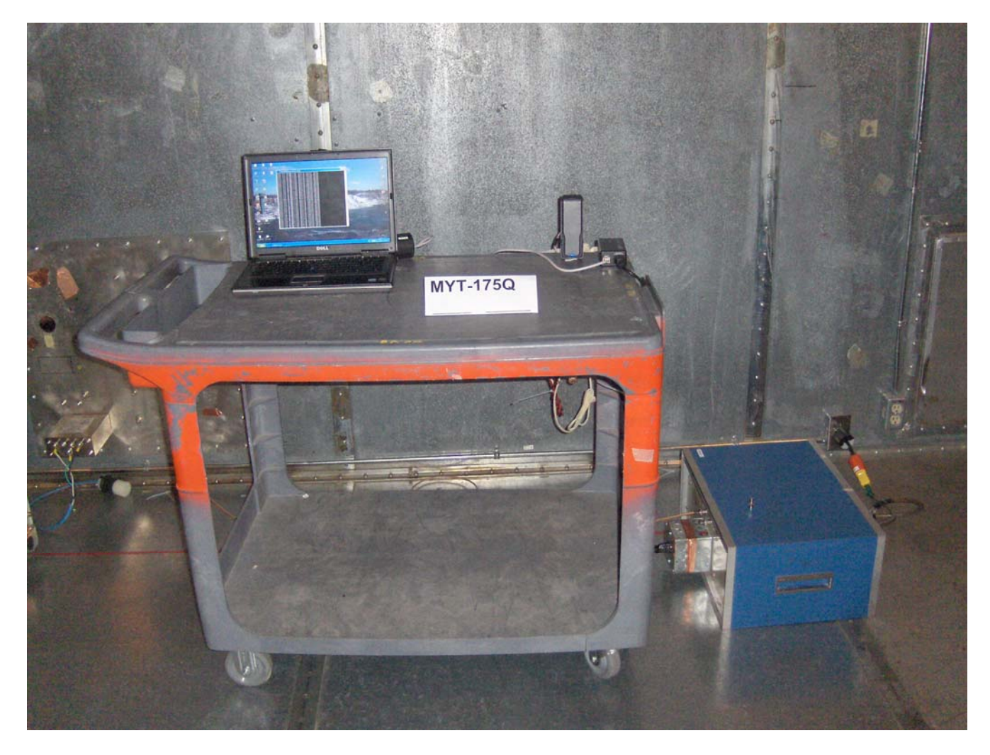
Power Line Conducted Emissions Test Configuration 2: Power over Ethernet (PoE) Injector