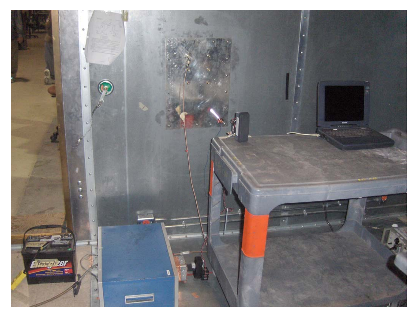
Power Line Conducted Emissions Test Configuration 1: External 12 VDC Power Source