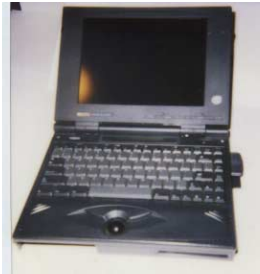
Fig. 1. Photograph of Cisco/Aironet Model LDK102040 Wireless PC with RF antenna inserted at the back on the right-hand side of the keyboard.