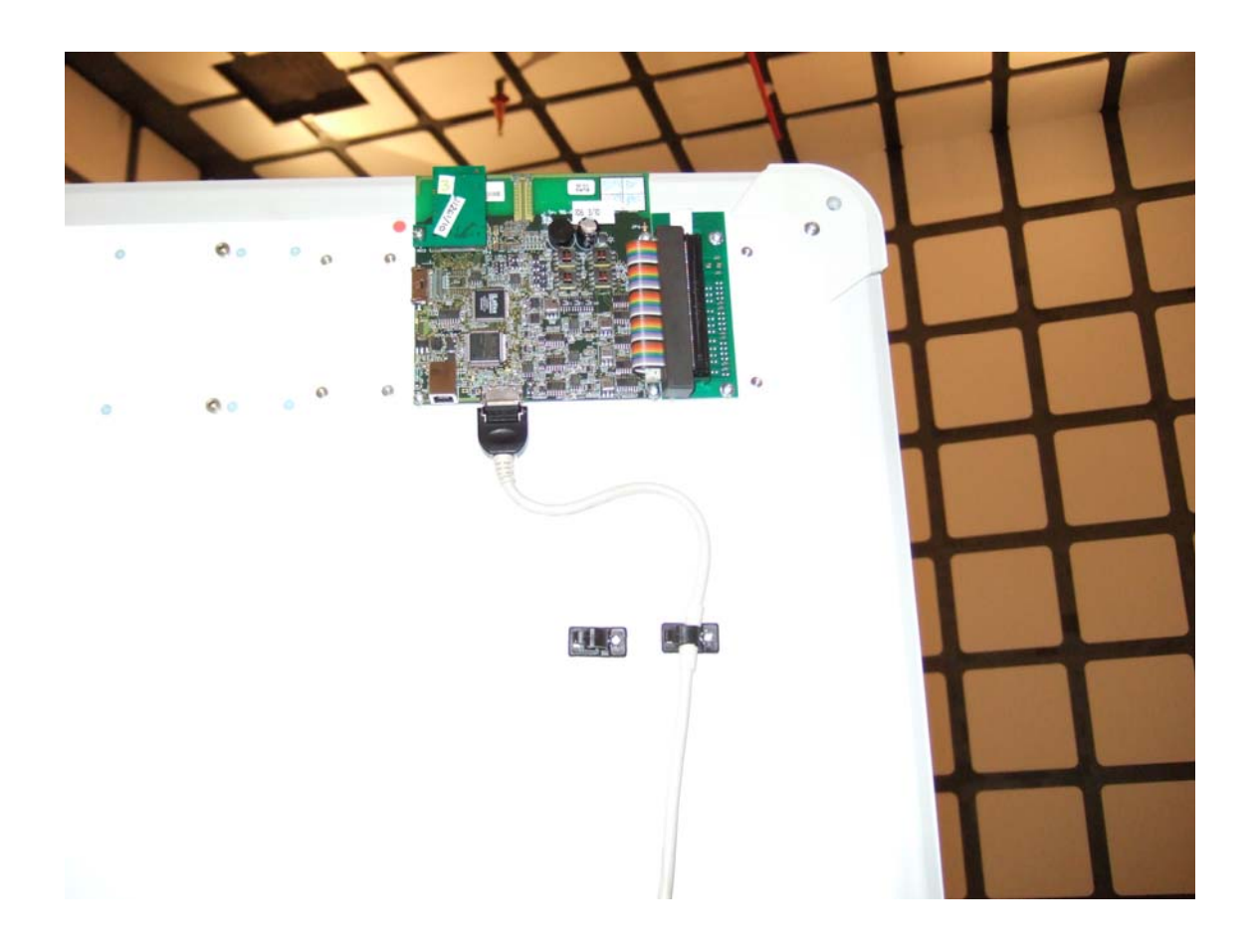
EUT Electronics In-Situ