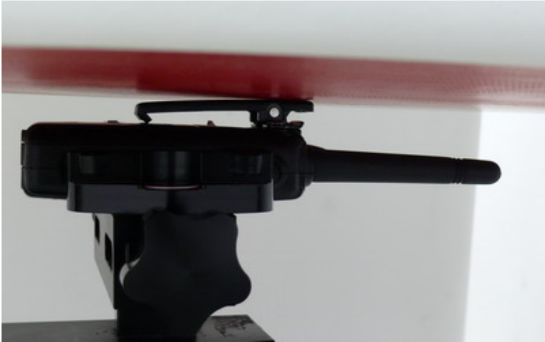
Picture 5: Body, The EUT display towards ground, Belt clip attach the Panntom