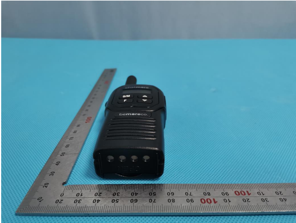
FRONT VIEW OF EUT