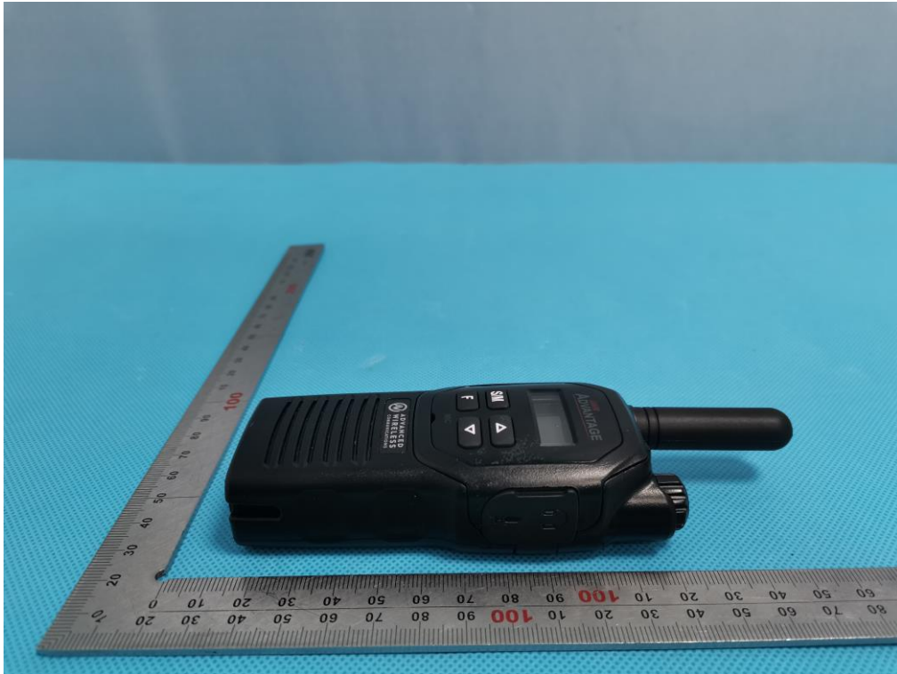
The model name of AWR-4002V3 TOP VIEW OF EUT