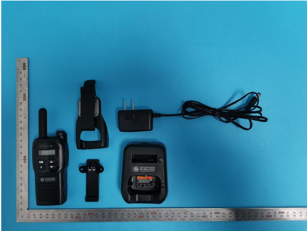
TOP VIEW OF EUT

The model name of AWR-4000V3 All VIEW OF EUT