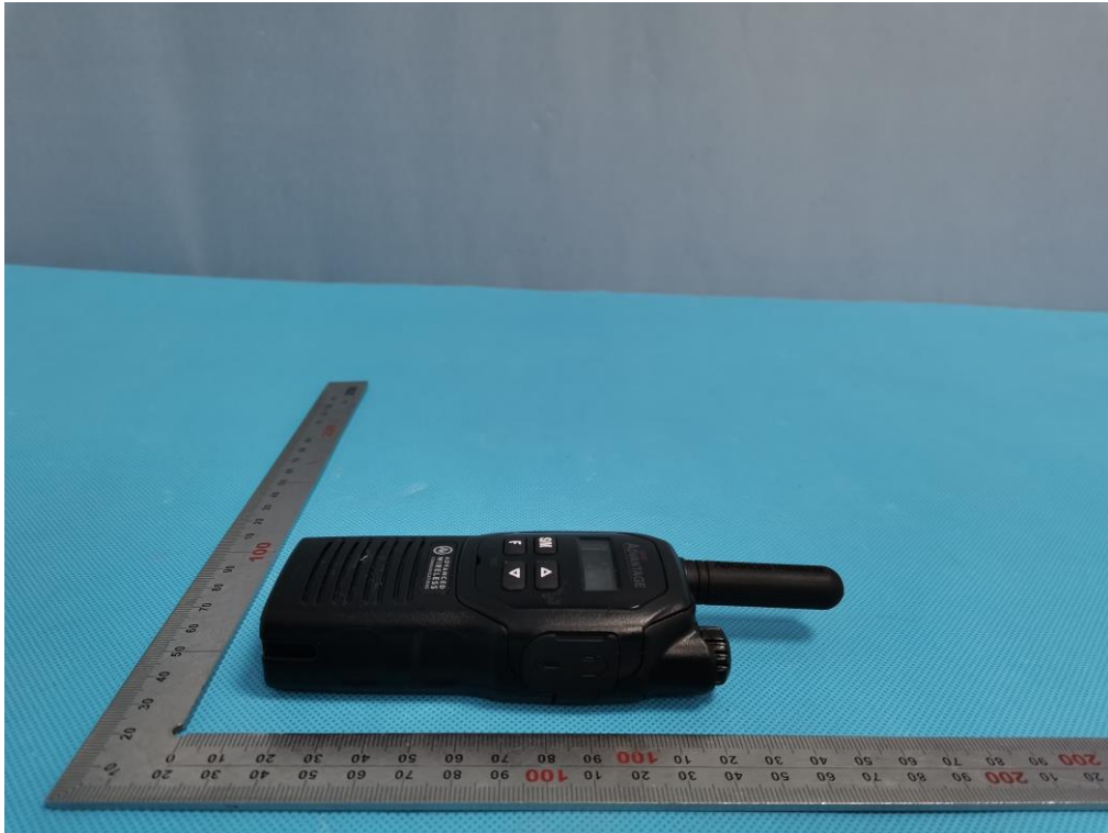
THE MODEL NAME OF AWR4002DU TOP VIEW OF EUT