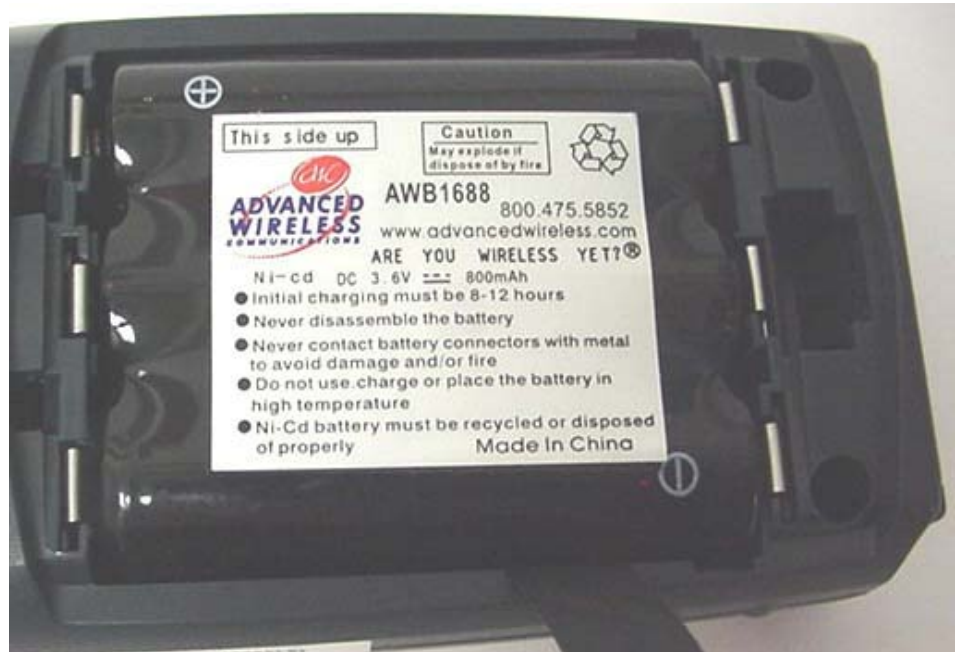
NiCd Battery Pack (P/N: AWB1688)