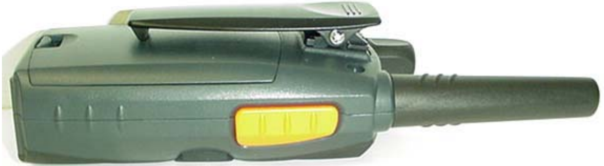
Left Side of DUT