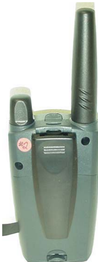
Back of DUT with Belt-Clip