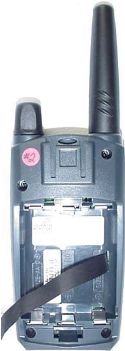
DUT Battery Compartment