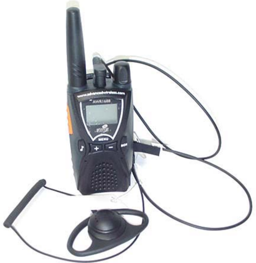
DUT with Ear-Loop Accessory (P/N: 420855203065)