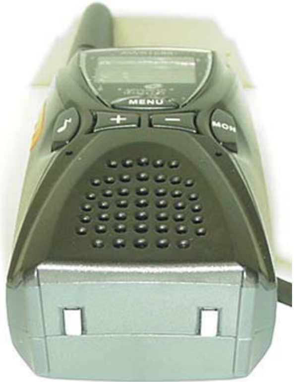
Bottom of DUT