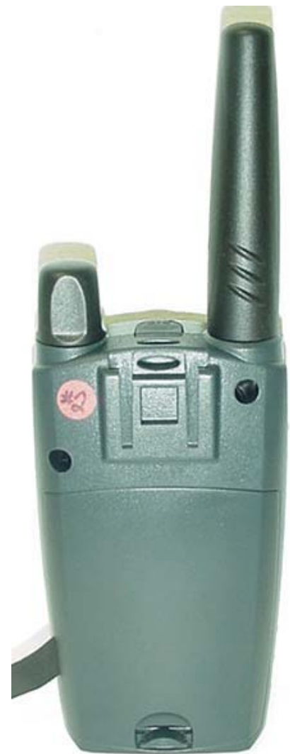
Back of DUT