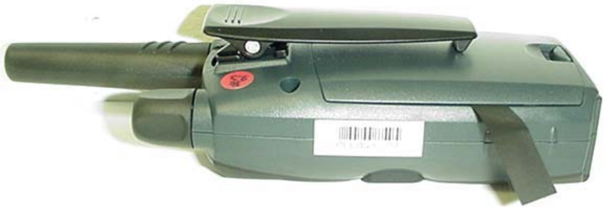
Right Side of DUT