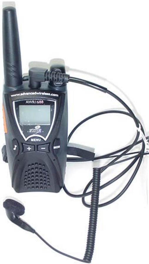
DUT with Ear-Bud Accessory (P/N: 420855203041)