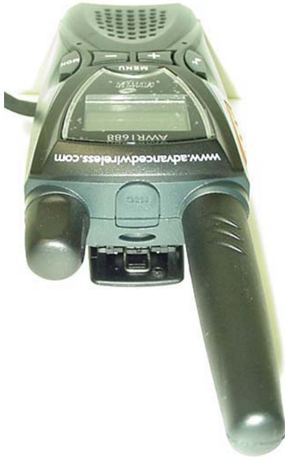
Top of DUT