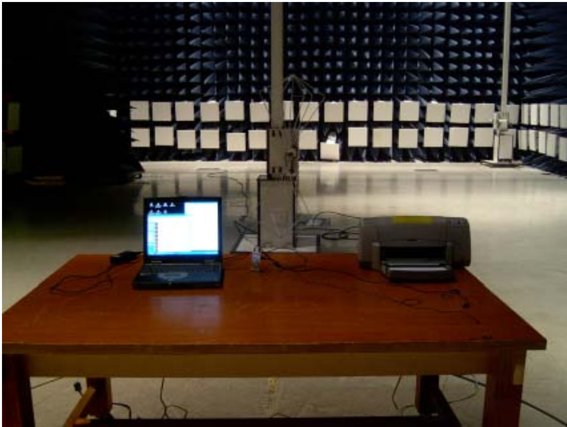
<FRONT PHOTO OF RADIATED DISTURBANCE >