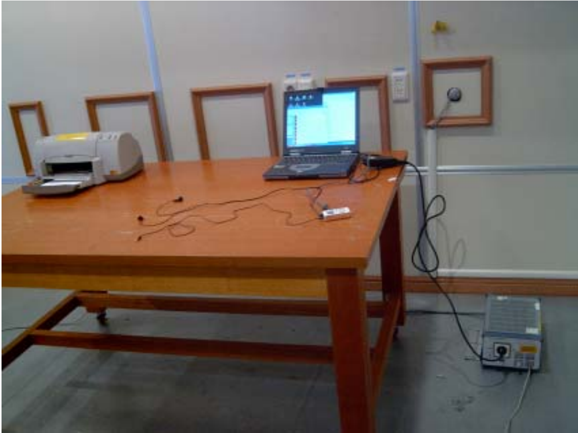
<FRONT PHOTO OF CONTINUOUS DISTURBANCE VOLTAGE >