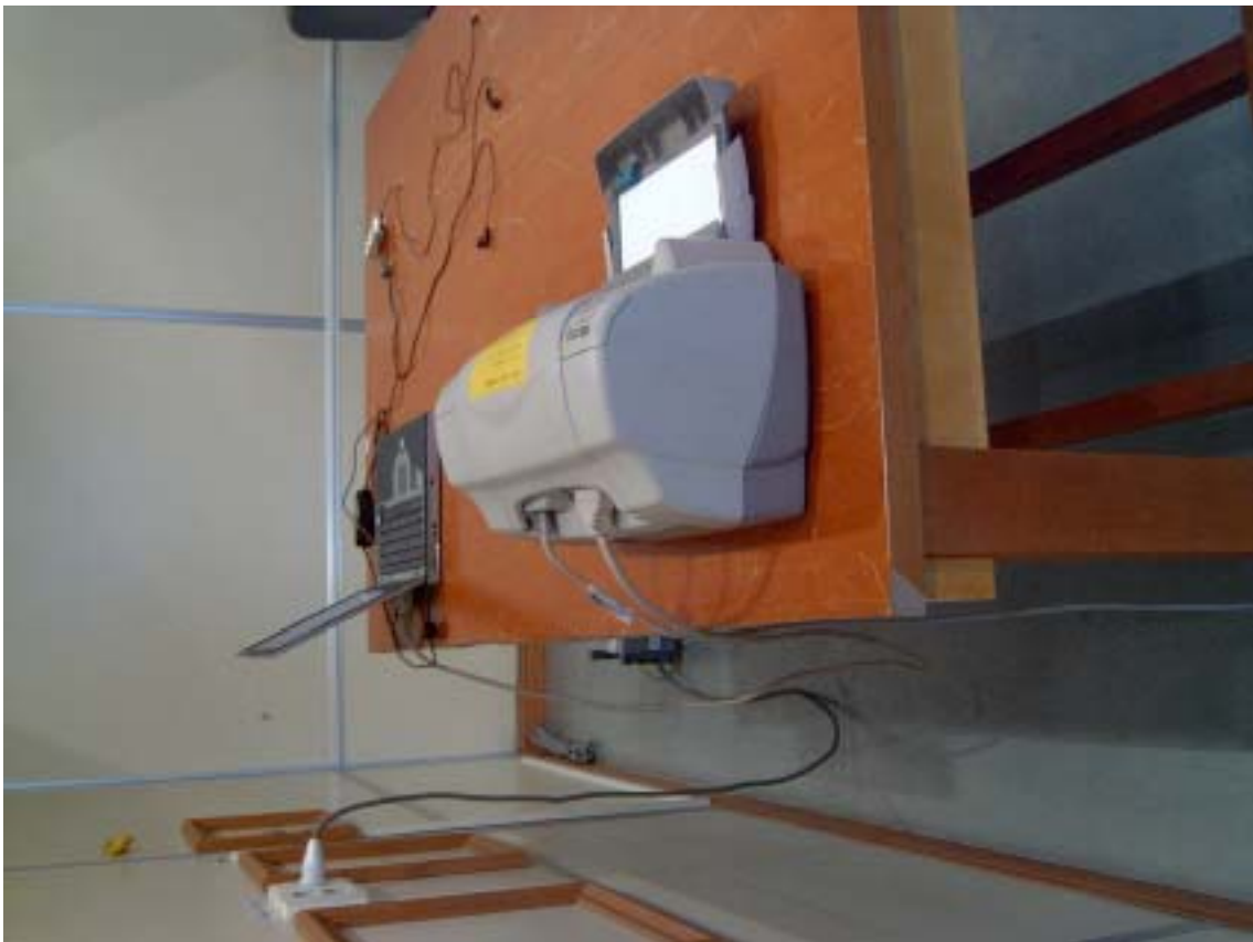
<SIDE PHOTO OF CONTINUOUS DISTURBANCE VOLTAGE >