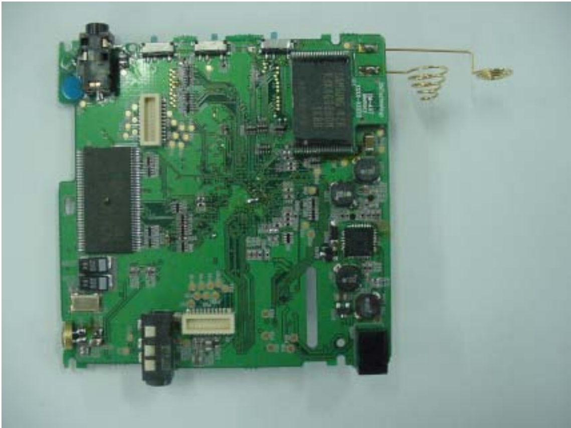
<REAR SIDE OF MAIN BOARD>