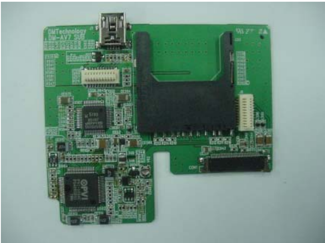
<FRONT SIDE OF SUB BOARD>