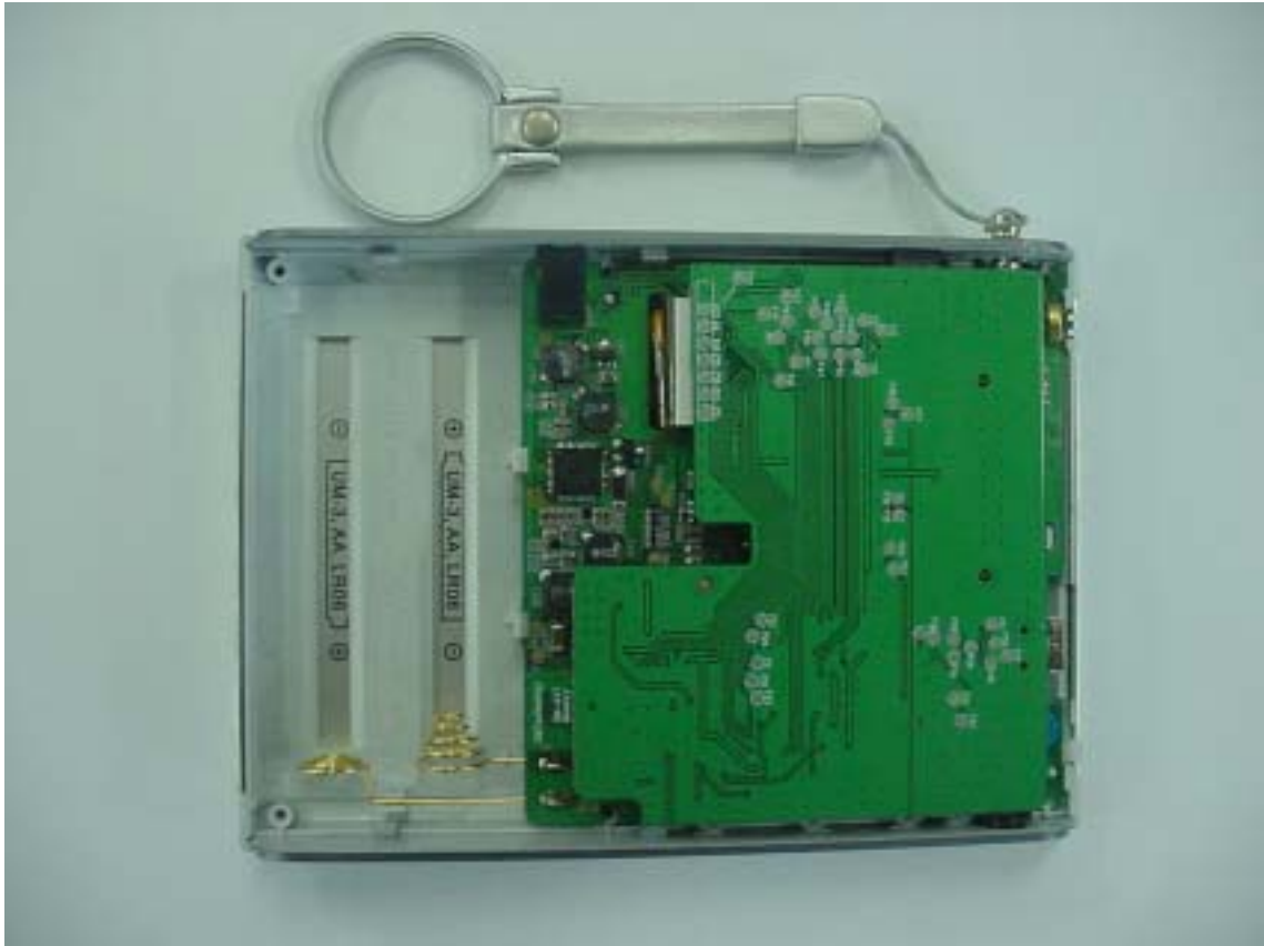
<INNER SIDE OF EUT>