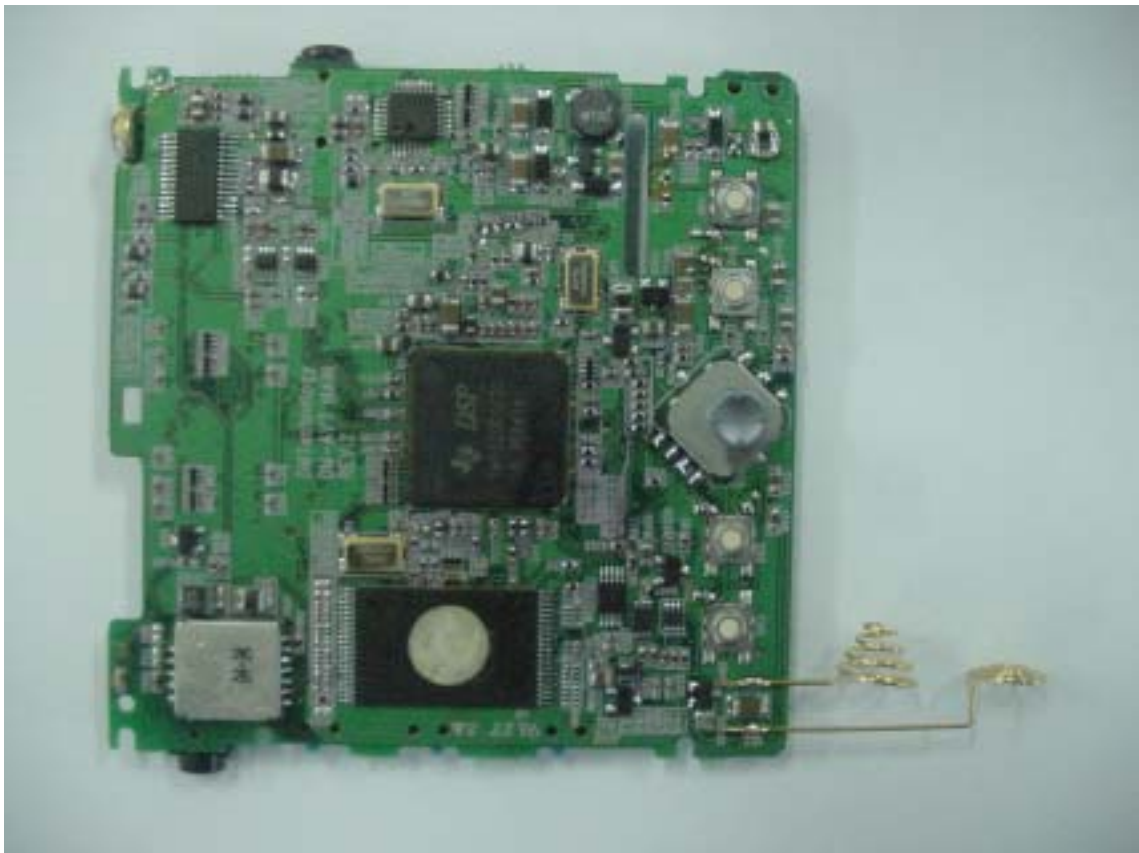
<FRONT SIDE OF MAIN BOARD>