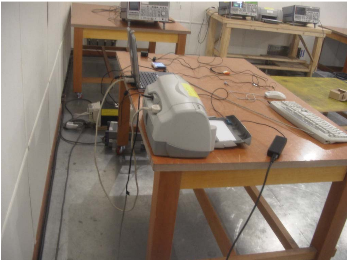
<SIDE PHOTO OF CONTINUOUS DISTURBANCE VOLTAGE >