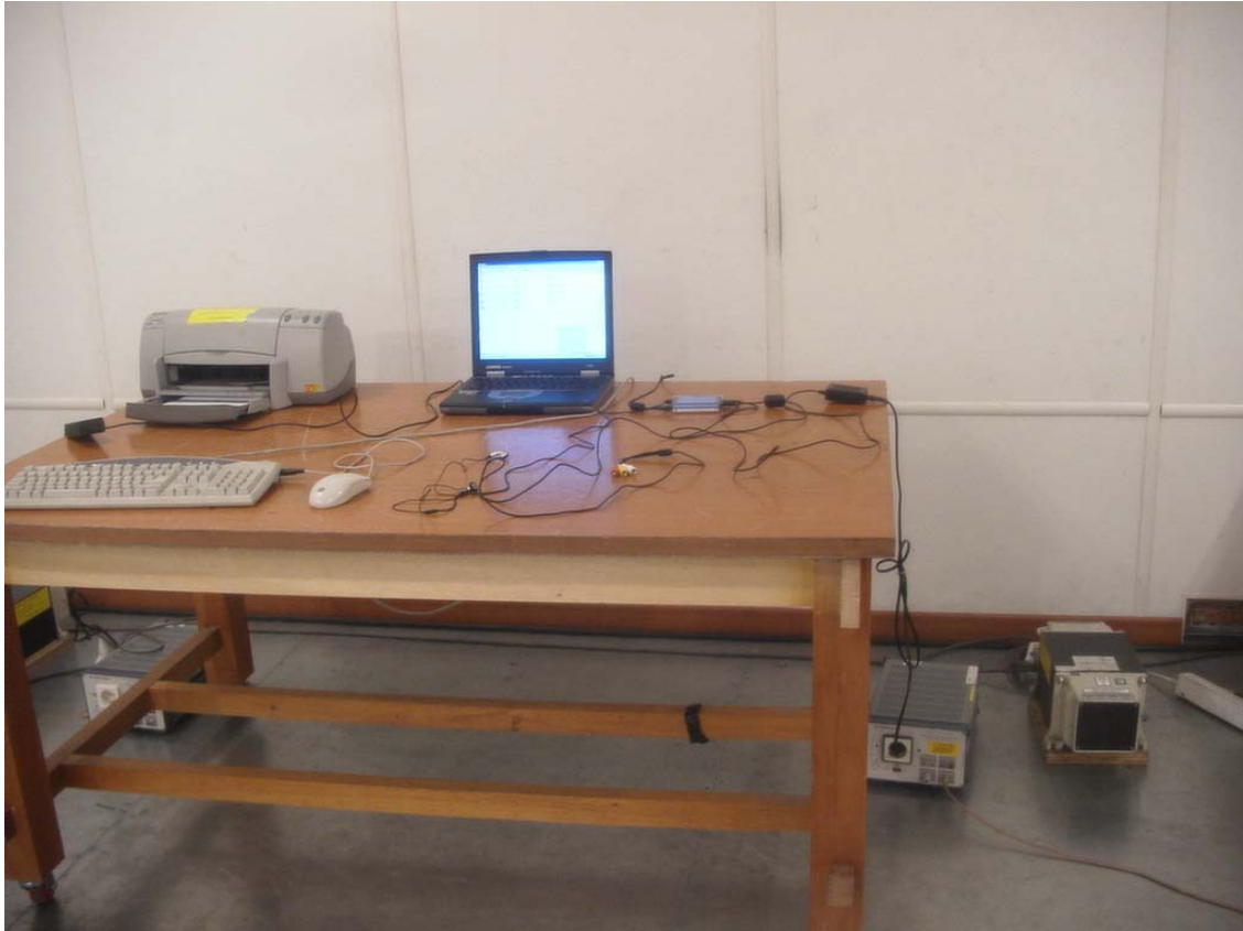
<FRONT PHOTO OF CONTINUOUS DISTURBANCE VOLTAGE >