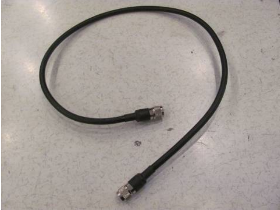
RF cable between antenna and RF connector

FCC ID: Q9DMSR4000AC IC: 4675A-MSR4000AC