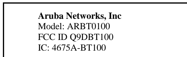
Figure 1.3.1. Representation of FCC Label information.

The FCC label shown is representative of the label that will appear on the radio when in production.