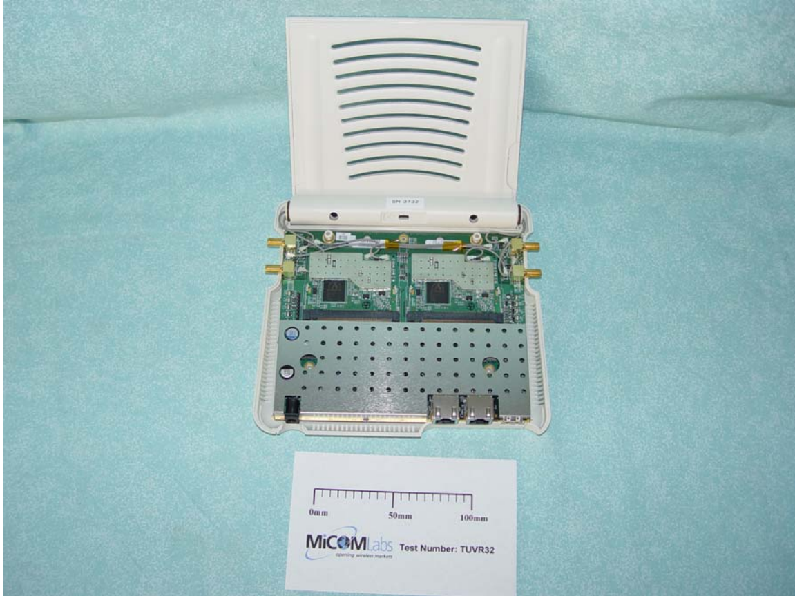
AP70 Wireless Access Point – Internal Photograph