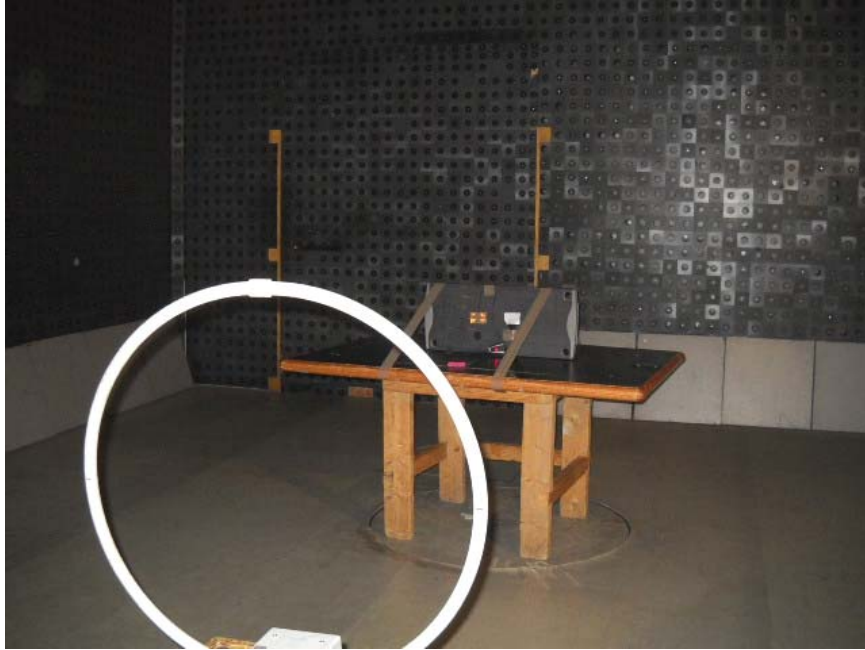
Photograph No.1 Spurious emissions field strength measurement setup in the anechoic chamber below 30 MHz