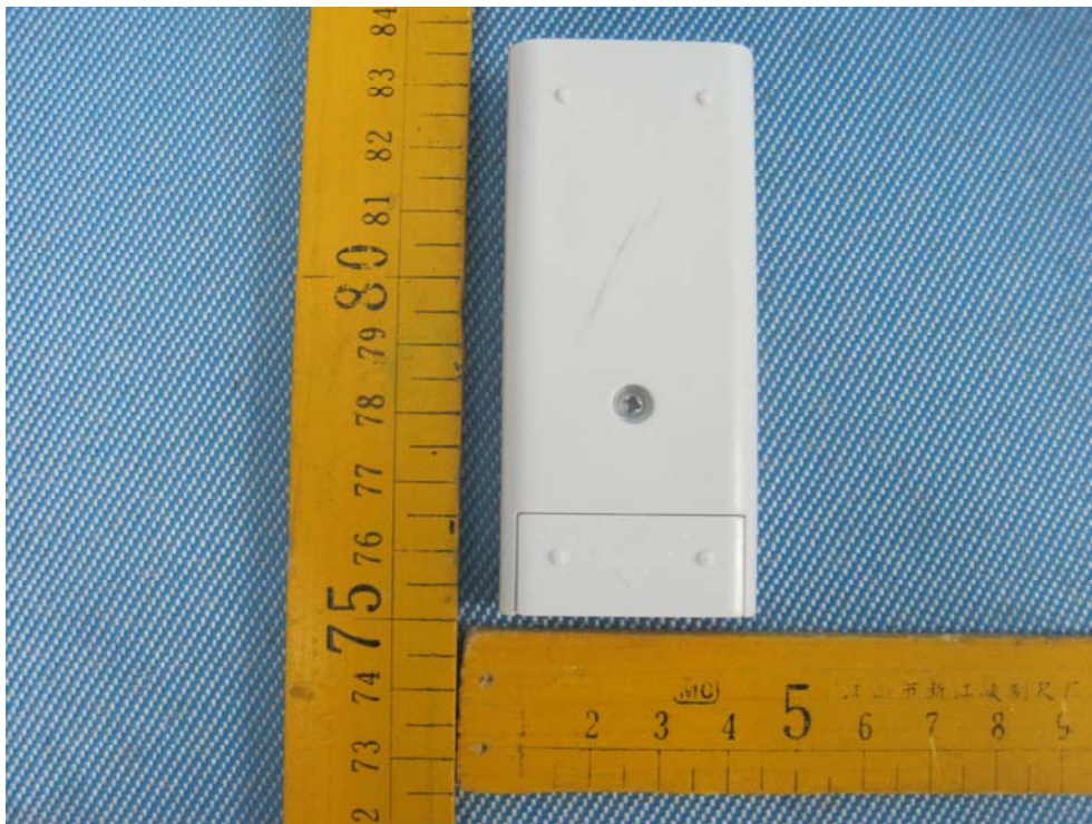
Model for BH-O