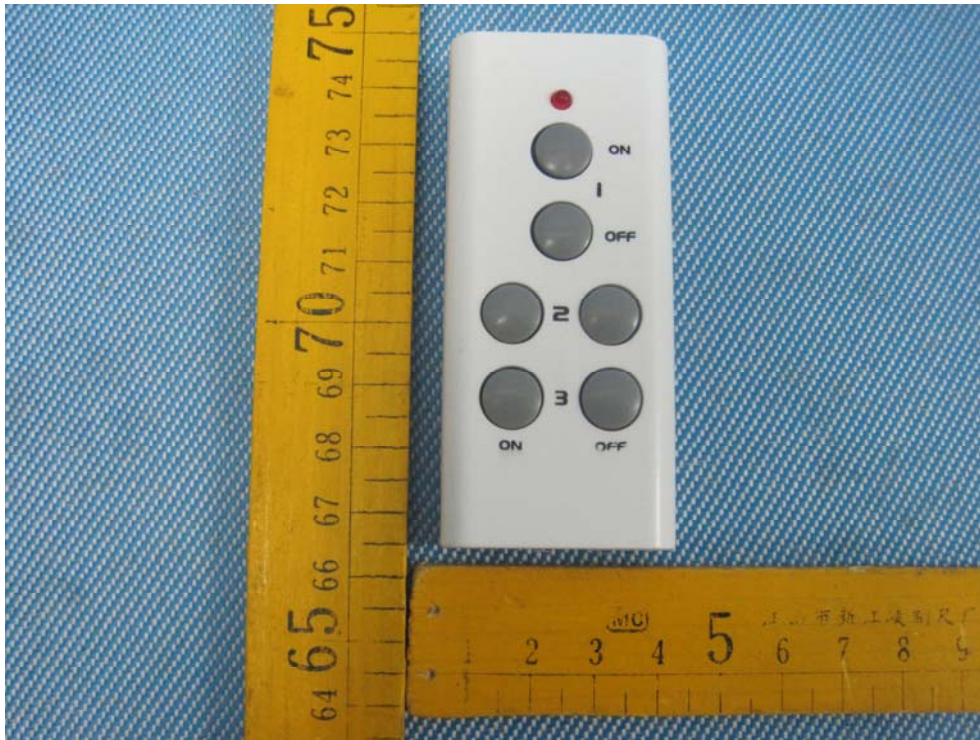
EUT (TX) - Back View