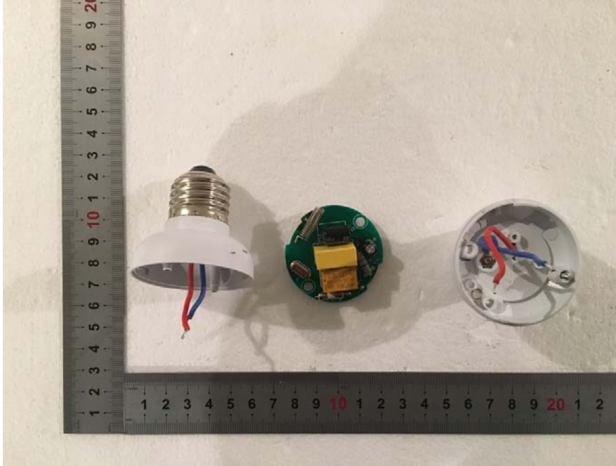
EUT -PCB Top View