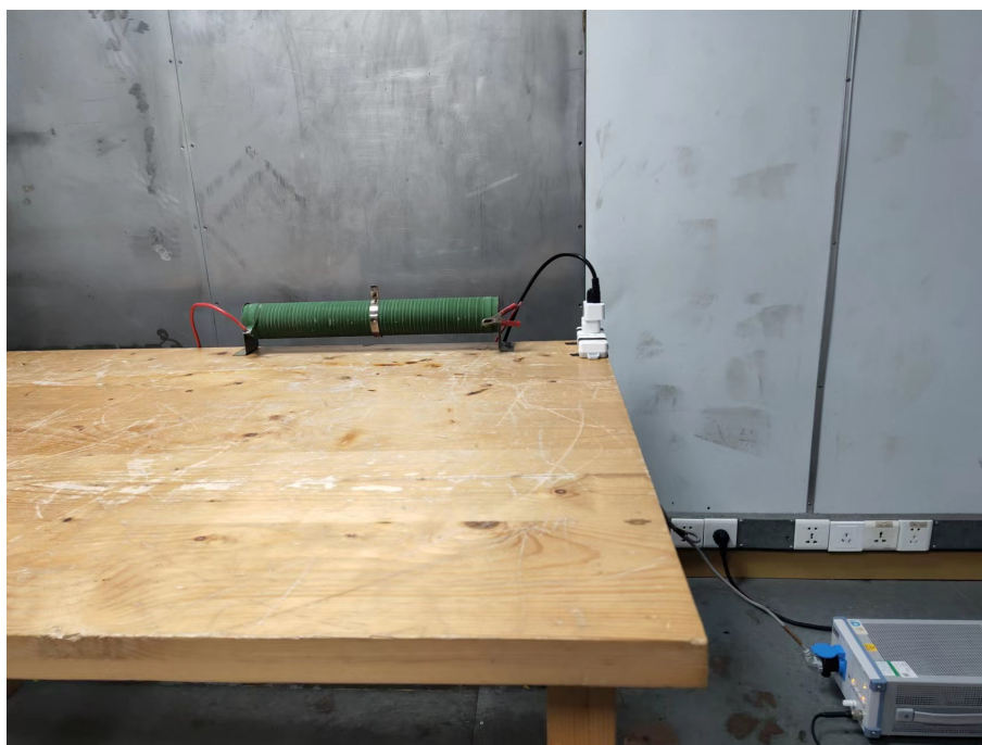
Photo of Conducted Emission Measurement