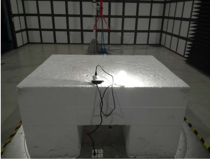
Radiated Emissions- Rear View (Below 1G)