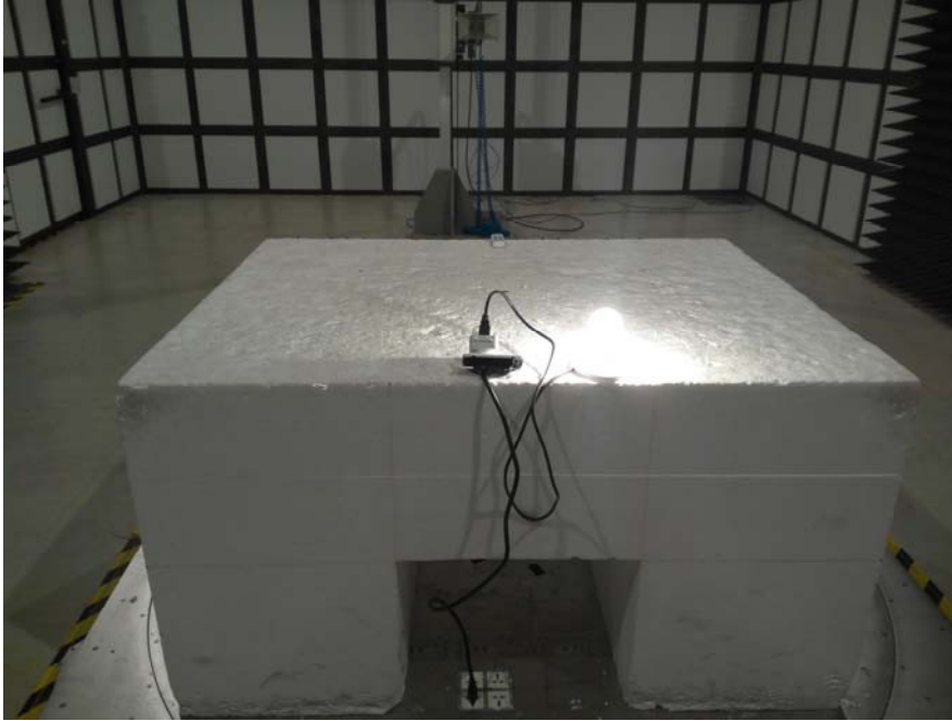
Radiated Emissions- Rear View (Above 1G)