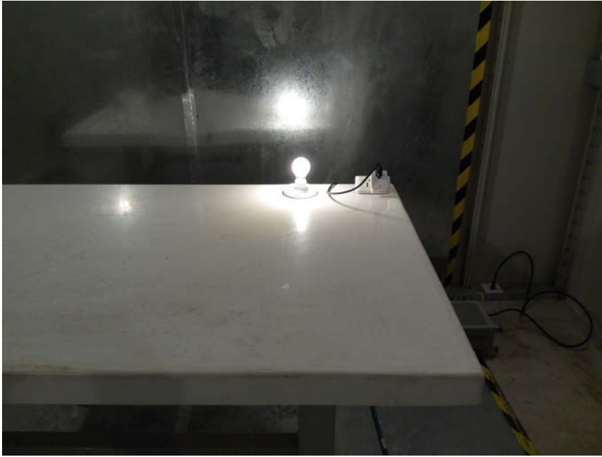
AC Line Conducted Emissions - Side View