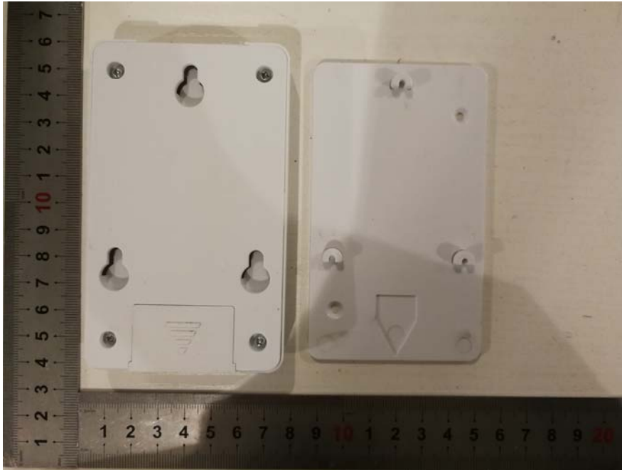
EUT – Cover off View-2