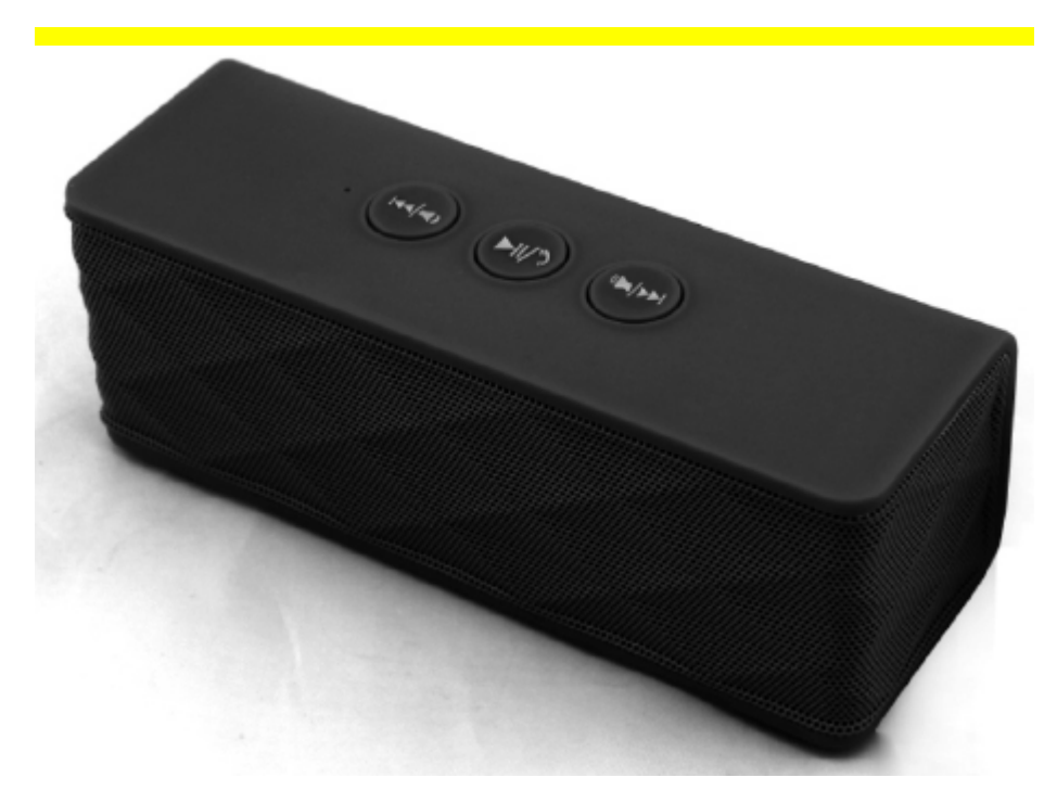
Bluetooth speaker (BT25S)