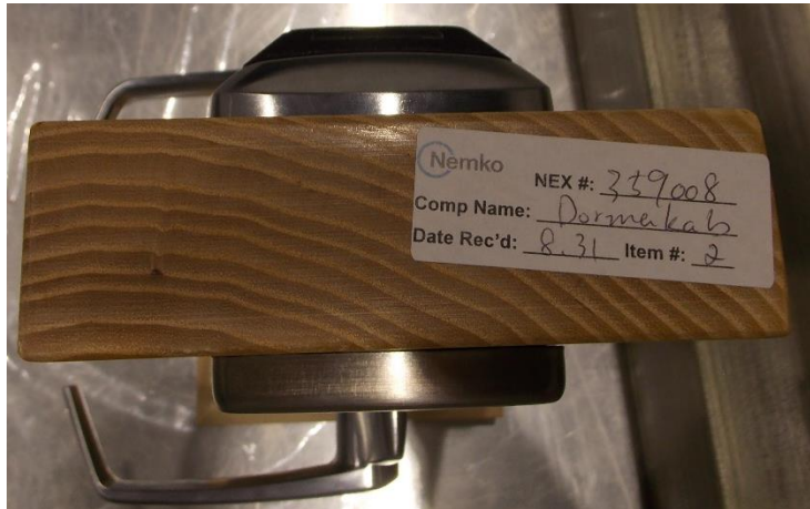
Figure 1.1-4: Top view photo