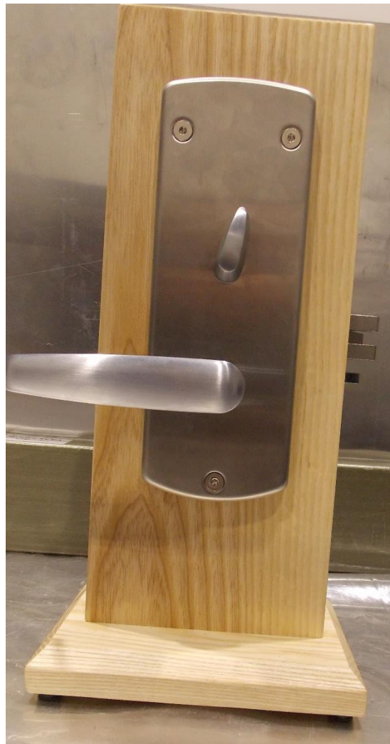
Figure 1.1-2: Rear view photo