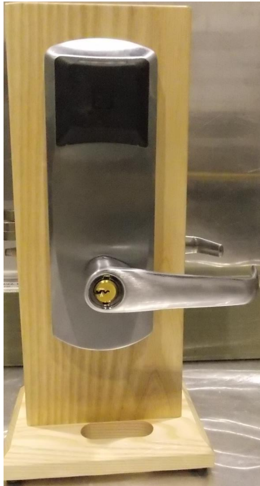
Figure 1.1-1: Front view photo