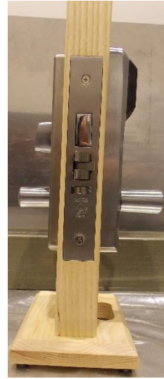
Figure 1.1-3: Side view photo6