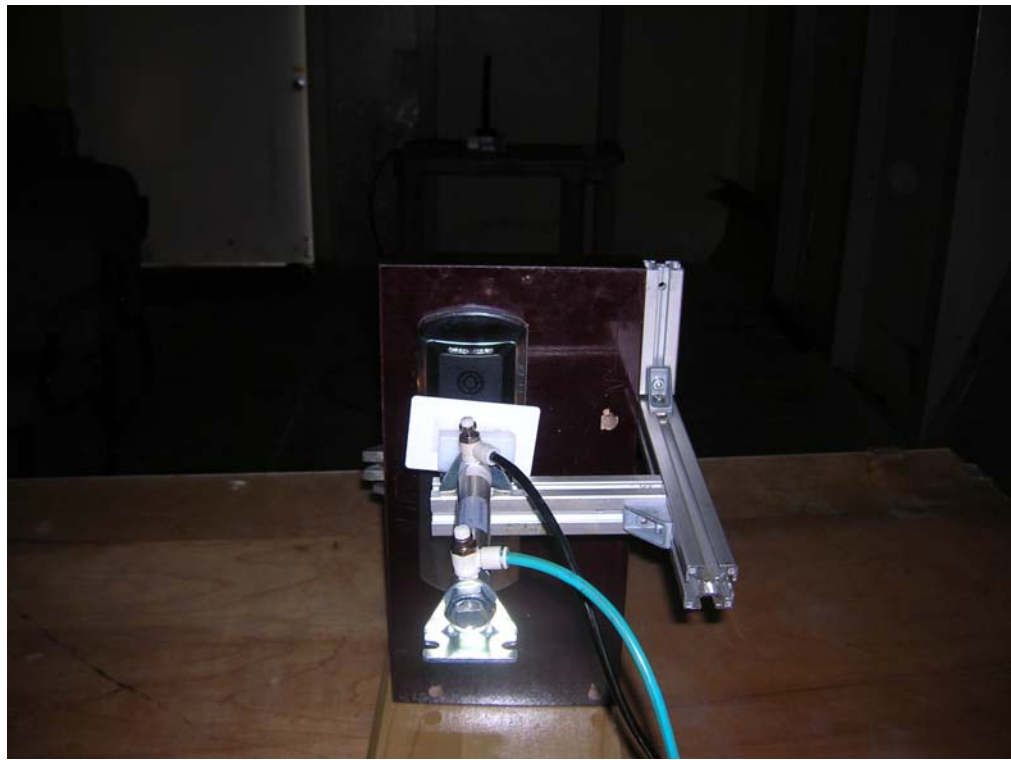
Radiated Emission – Fundamental Frequency (13.56 MHz) – Rear