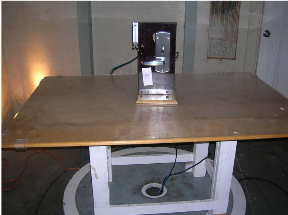
Spurious Radiated Emission – Front