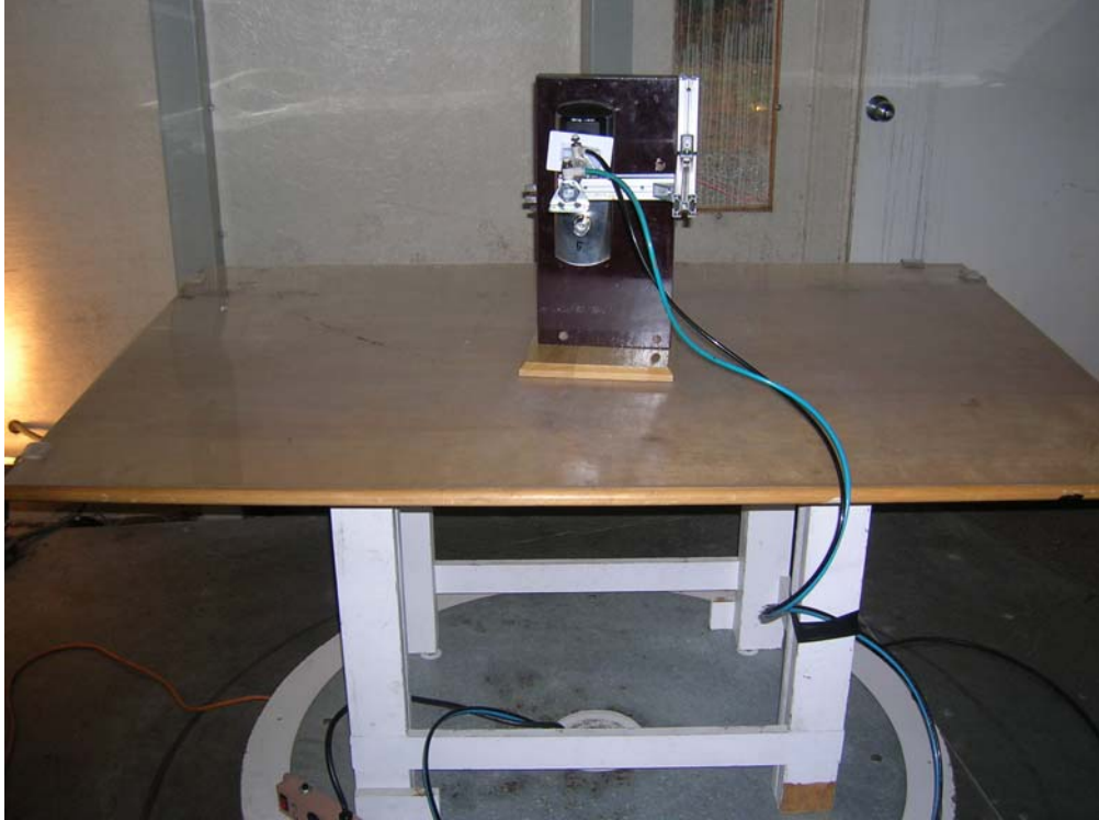
Spurious Radiated Emission – Rear