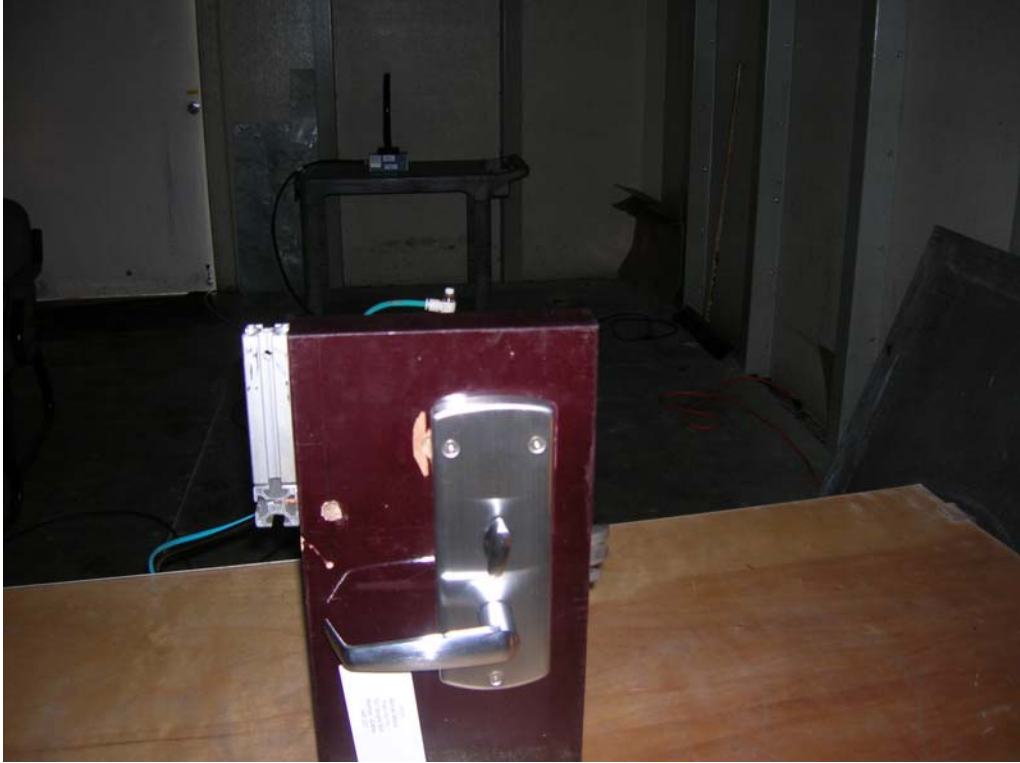
Radiated Emission – Fundamental Frequency (13.56 MHz) - Front